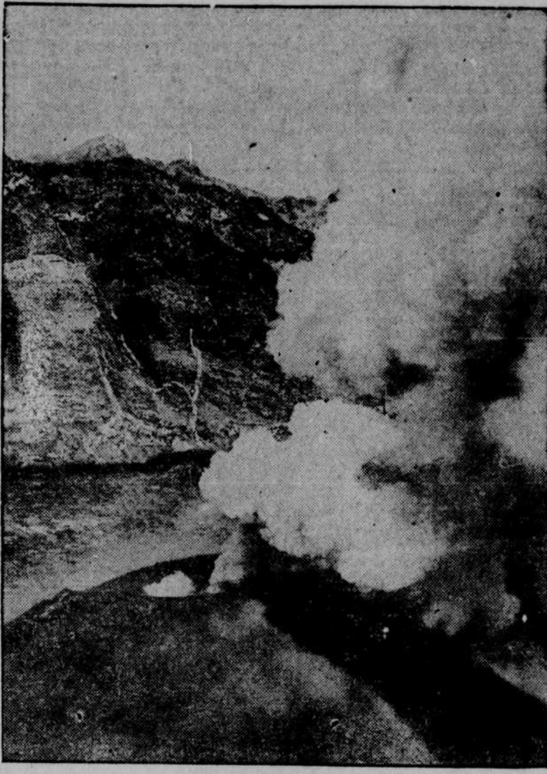
This remarkable photo shows the fiery flood of molten lava flowing from one of the craters of Mount Etna, Italy, and which left death and destruction in its wake. This is the first and exclusive photo of the actual eruption.