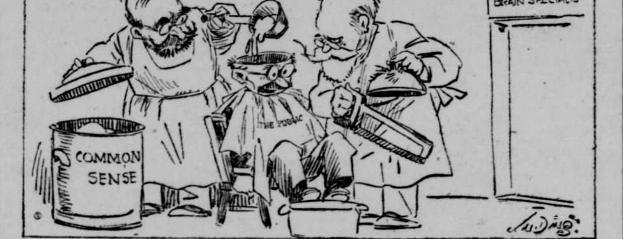
When What Is Needed Is a Simple Operation on the Owner.