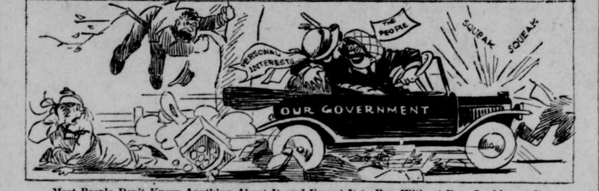
Most People Don't Know Anything About It and Expect It to Run Without Ever Looking at It.