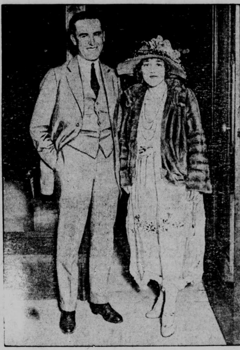
Harold Lloyd and his bride, formerly Miss Mildred Davis, also a screen star, leaving a Chicago theater after witnessing his latest movie thriller.

Chicago.—Harold Lloyd, known as the "dardevil of the films," received the disappointment of his life upon arrival here with his bride, Mildred Davis, screen star. Lloyd jumped nimbly from a Pullman at the Dearborn station and hurried to the city hall, where Mayor Dever presented him with the keys to the city.