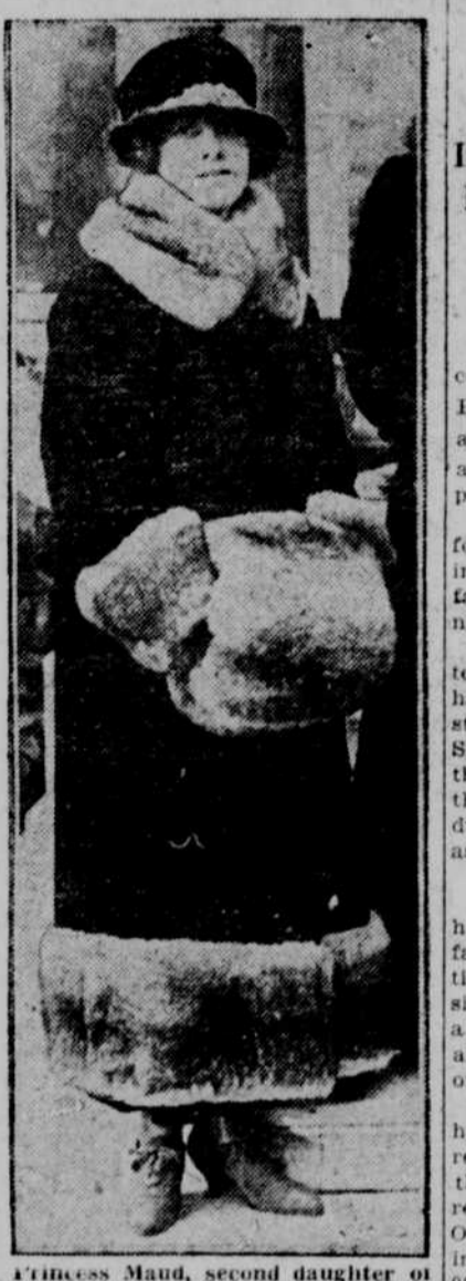
Princess Maud, second daughter of the king of England, and Lord Carnegie, eldest son of the earl of Southesk, are engaged.