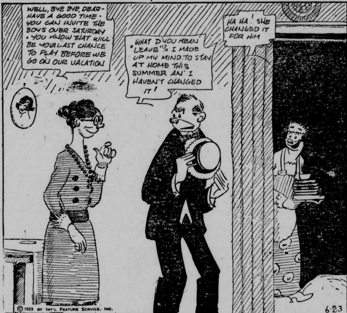
Wife plays her trumps.