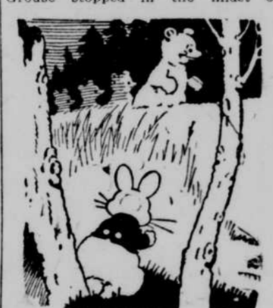
Lazily shuffling along the Lone Little Path, Mother Bear was just coming into sight.

So they moved slowly along the Lone Little Path, stopping often, for the baby Grouse were too tiny to travel far at a time. Suddenly Mrs. Grouse stopped in the midst of