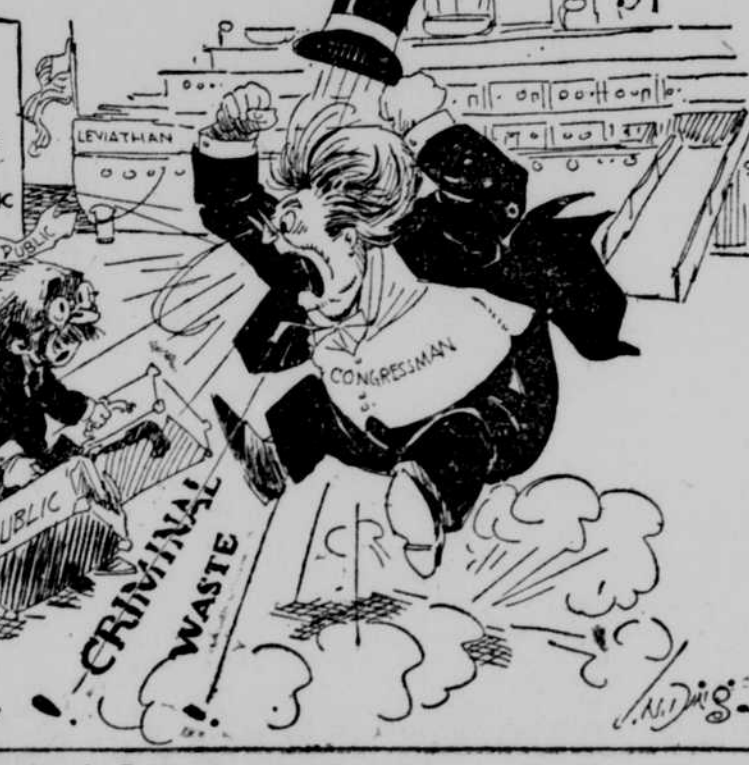
But to Think of Letting the Public in on Any Such Privilege—Mercy!