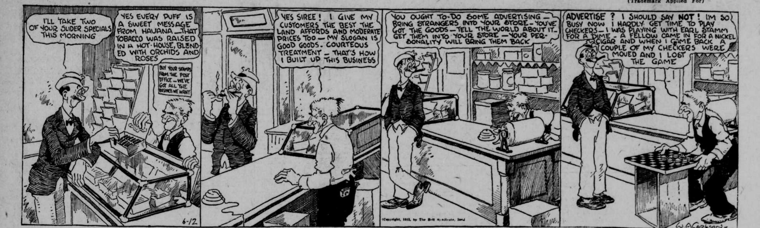
Drawn for The Omaha Bee by Sol Hess