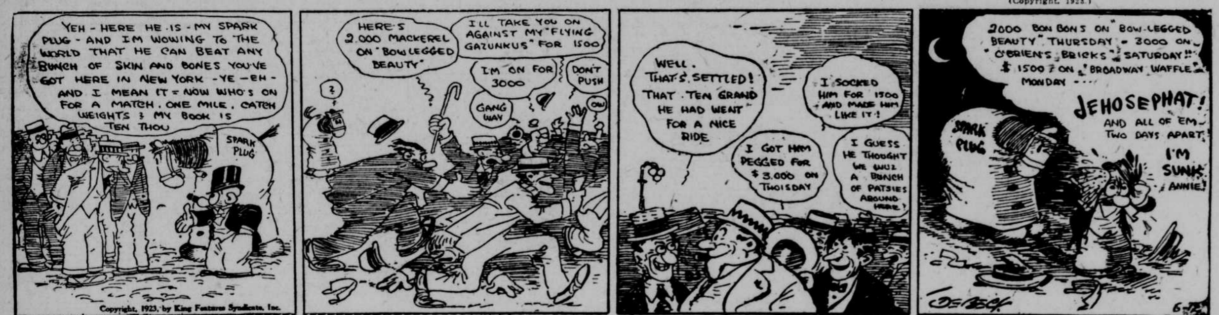
Drawn for The Omaha Bee by Billy DeBeck