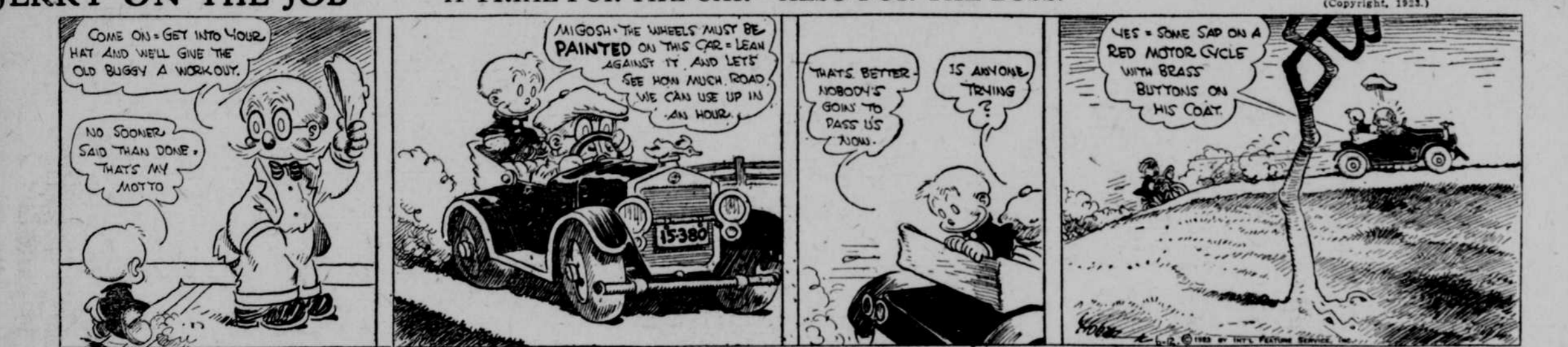
Drawn for The Omaha Bee by Hoban