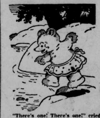
"There's one! There's one!" cried Littlest Bear excitedly.

where Mother Bear was keeping her motionless watch. Littlest Bear's