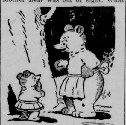
Mother Bear returned and found her playing on the ground instead of up in the tree.

Mother Bear sent them up a tree Littlest Bear was down just as soon as Mother Bear was out of sight. What