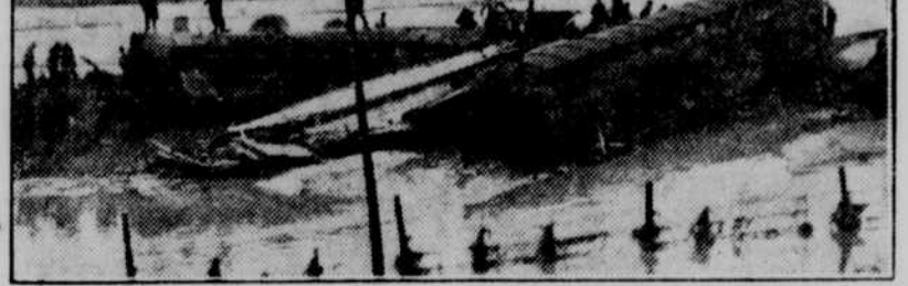
Fireman of Burlington train No. 2, eastbound from Denver, was killed in this wreck near Benkelman, Neb., last Wednesday. The locomotive, a baggage car and an express car left the rails, weakened by a cloudburst. None of the passengers was hurt. Traffic was held up four or five hours, or detained by way of Alliance.