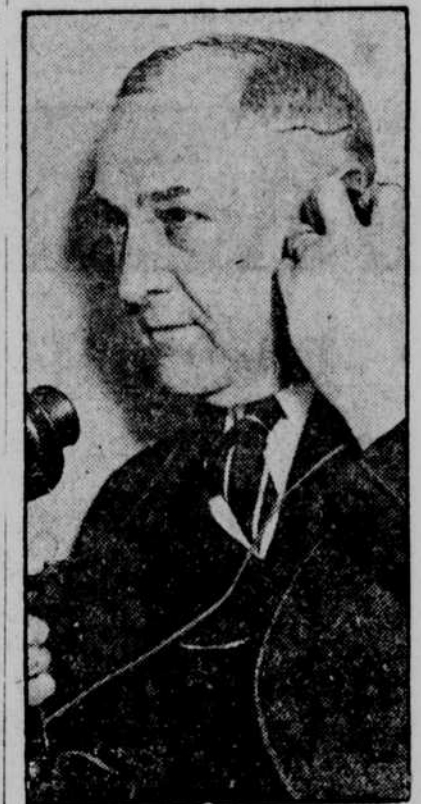
Atty. Gen. Daugherty.

Washington, May 17.—Resignation of Attorney General Harry Daugherty is believed imminent here. Mr. Daugherty has been in ill health for some time. He recently returned from the south, where he had been convalescing, but was unable to resume his full duties. He has left for his home in Columbus, O., and he is not expected to return for some time. Mr. Daugherty was President Harding's strongest supporter for the nomination at the republican national convention and managed his pre-convention campaign.