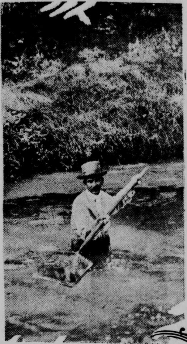
Fish Commissioner "Bill" O'Brien, probably the best known man in the state among sportsmen, who is reported slated for removal by Governor Bryan.