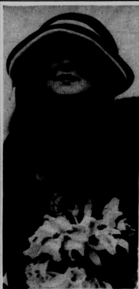
HON VOYAGE! Mme. Maria Jeritza, star songbird of the Metropolitan Opera Company, snapped as she sailed aboard the Majestic Recently to fill her engagement at the Vienna Opera, where she will sing under the direction of Richard Strauss. "I am delighted to return to 'my own city,'" she said.