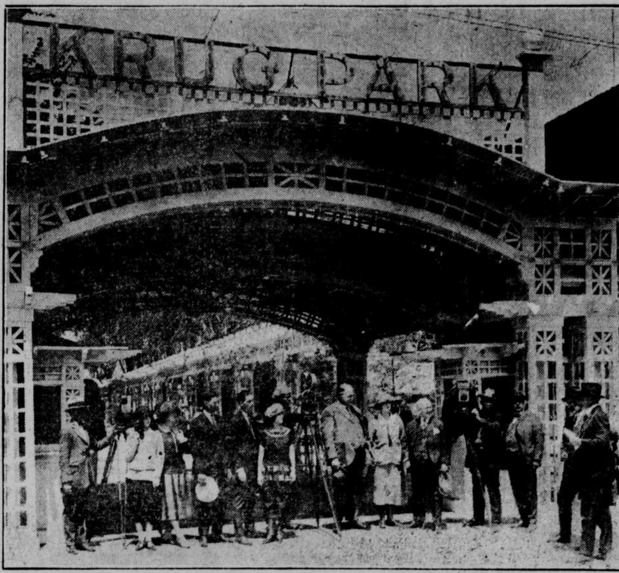
Benson high school students who are the movie stars of a home talent photoplay. Scenes of the "elopement" of the scenario are to be filmed at Krug park Saturday and Sunday in order that the crowd there may be the "extras" for the picture.

Home talent plays used to be quite the thing. Now home talent motion pictures seem to be getting a grip on the amateurs' fancy. Benson is an example of this. A few years back the high school students and the younger folk would have picked a popular downtown opera house to stage their home talent show. But now they go out and contract with a