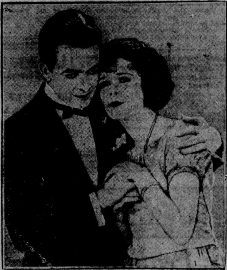
Rudy Cameron (Left), Anita Stewart (Right).

Los Angeles, May 8.—Anita Stewart, motion picture actress, intends to sue Rudolph Cameron, screen actor and director, and formerly her business manager, for divorce, according to a story published in the Los Angeles Times today.