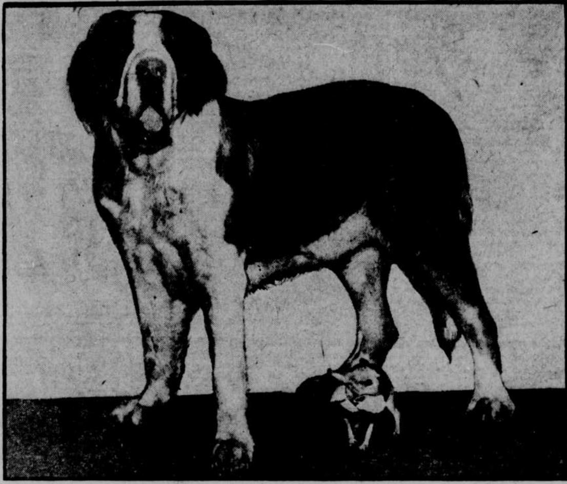
Largest and smallest dog at Westminster club show in New York were Champion Beauty, a St. Bernard weighing 190 pounds, and Pedro, a 1-pound 4-ounce Mexican Chihuahua. Both won blues.