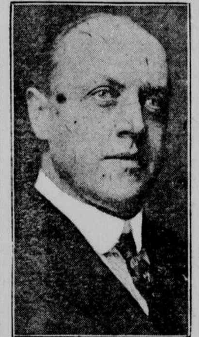
The Henderson Tire and Rubber Company, Inc., of Columbus, O., has opened a branch store for wholesale and retail trade at 2215 Farnam street. The doors of the new enterprise opened Saturday.