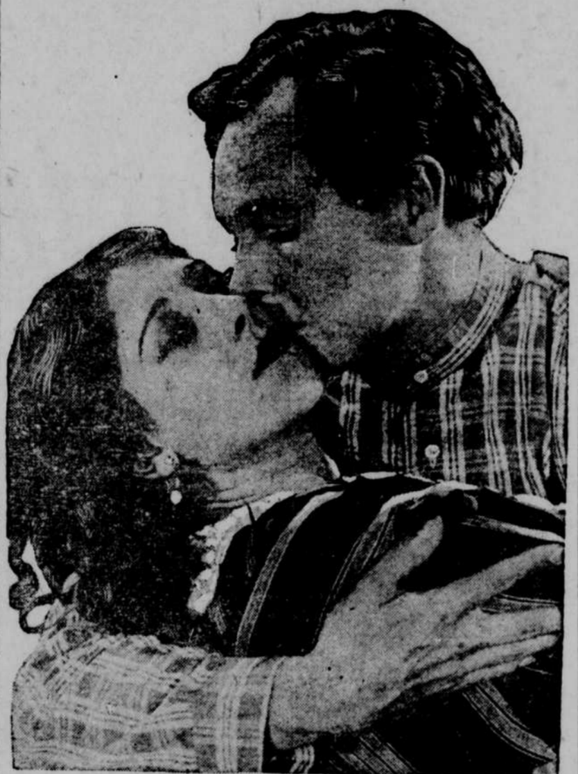
Charles Ray and Patsy Ruth Miller. Charles Ray in "The Girl I Loved," tells in pictures on the screen James Whitcomb Riley's personal love story as written by the Indiana poet in his verses under that title. With him in the picture is Patsy Ruth Miller and the picture is receiving the word of praise from the motion picture world and critics. Ray is welcomed back into his role of the country boy.