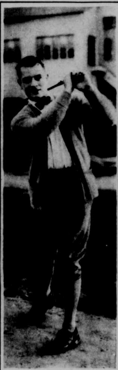
Evidently it promises to be a good drive. Reginald Denny does his eighteen holes to keep fit and, incidentally, for recreation.