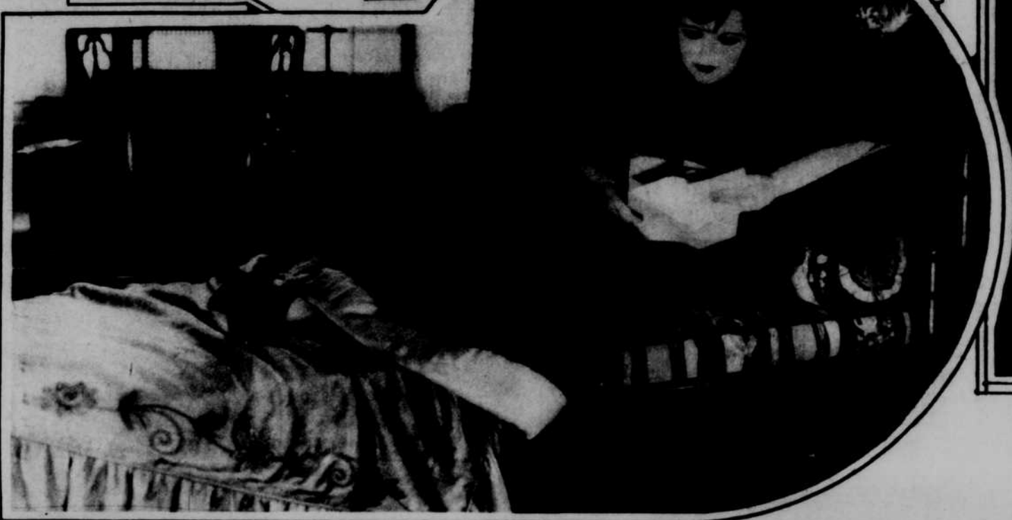
LEFT—Pola Negri spends a quiet hour after lunch in her dressing room at the studio where she is making "Bella Donna."