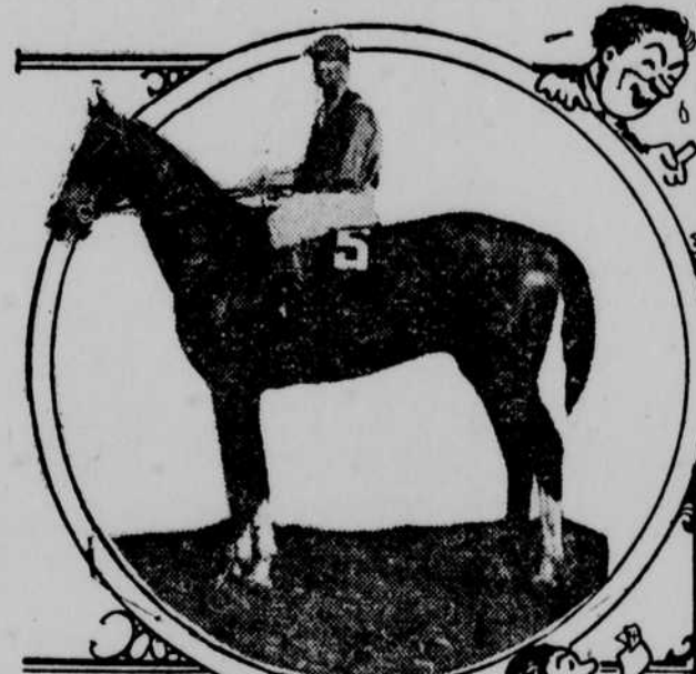
THE WINNER POSES FOR THE CAMERA MAN.

It Won't Be Long Until the Turf Cracks Run at Ak-Sar-Ben Track