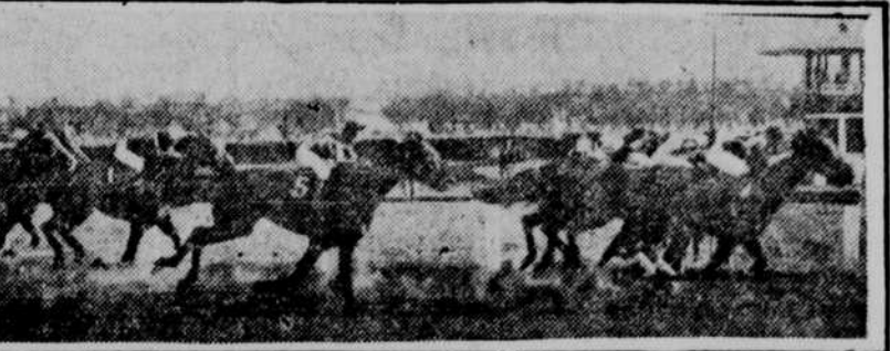
A THRILLING FINISH

The cream of the western turf will race here. That means that runners in the class of Adonis, John S. Reardon, Abadane, Delante and others will perform before Omahans.