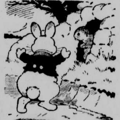
Hiaw! "Hello, Johnny Chuck! My, but I'm glad to see you!"

Peter Rabbit was hurrying along on his way home to the dear Old Briar Patch.