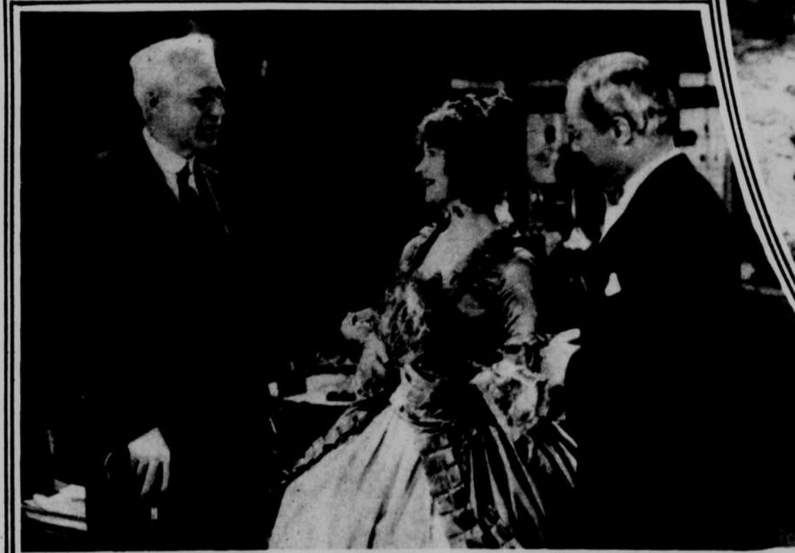
Mr. Frank A. Vanderlip (left), well known financier, snapped with Betty Compson, screen star, and Herbert Brenon, her director, while on a visit to the studio at Hollywood.