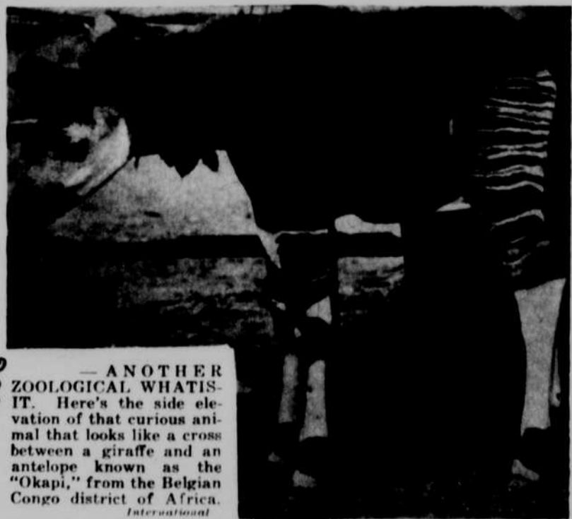
ANOTHER ZOOLOGICAL WHAT-IS-IT. Here's the side elevation of that curious animal that looks like a cross between a giraffe and an antelope known as the "Okapi," from the Belgian Congo district of Africa.

Send your name and address to: Mary T. Goldman, 1017 C. O. B. Bldg., St. Paul, Minn. Please send your patented Free Trial Bottle. I show color of hair: Black, dark brown, medium brown, ash-brown, dark red, light brown, light ash-brown, light red, blonde.