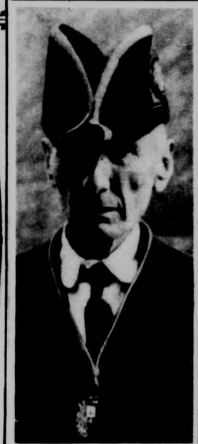
NEATH THIS ADMIRAL'S COCKADE is President Buenaventura of Andorra, the smallest republic in the world, that lies high up in the Pyrenees and boasts a population of but 2,000.