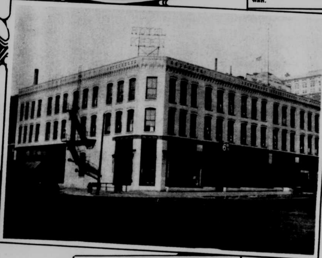
A FEW NEW TIMBERS, A LITTLE PAINT FRESTO CHANGO —A good example of reclamation by the building tradesman. Just a few years ago this building housed a fire station and became so dilapidated the city decided to abandon it. Now it's a first-class hotel building. The location is Eighteenth and Harney.