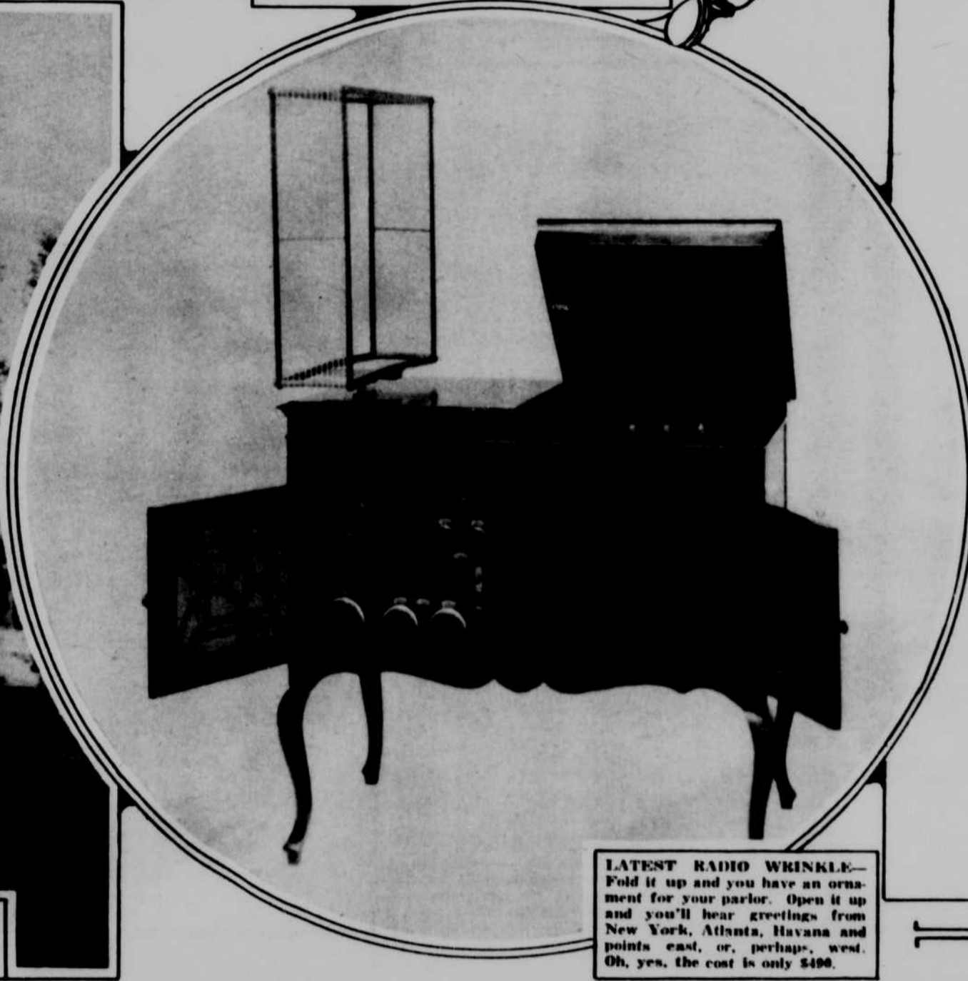
LATEST RADIO WRINKLE —Fold it up and you have an ornament for your parlor. Open it up and you'll hear greetings from New York, Atlanta, Havana and points east, or, perhaps, west. Oh, yes, the cost is only $400.