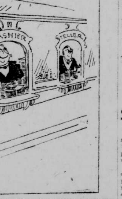
WHY DON'T THE BANKS INSTALL DEPARTMENTS FOR THE OUTFITTING OF BANK ROBBERS AND GET THE EXTRA PROFITS?