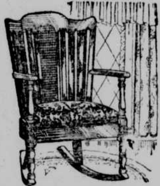
Chairs and Rockers

Bedroom Chairs and Rockers About Half Off $13.50 Mahogany Windsor Chairs for $9.50 $27.50 Mahogany Windsor Chairs for $15.00 $32.50 Mahogany Windsor Chairs for $17.50 $27.50 Mahogany Cane Chairs, only $16.50 $7.50 Mah. Queen Anne Dress Chair $5.00 $39.50 Mahogany High-Back Chair $29.50 $27.50 Mah. tapestry covered Rocker $19.50 $21.50 Mah. tapestry covered Rocker $14.95