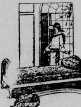
Odd Day Beds

$52.50 Walnut Veneer China Closet $37.50 $67.50 60-inch Jacobean Oak Buffet $47.50 $72.50 Walnut Veneer Dining Table $45.00 $79.50 60-inch Walnut Finish Buffet $49.50 $89.50 Queen Anne Jacobean Buffet $57.50 $74.50 60-inch Walnut Veneer Buffet $45.00 $67.50 50-inch Fumed Oak Buffet $45.00