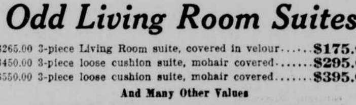
Odd Living Room Suites

$19.50 Steel Day-Bed with mattress $14.75 $34.95 Steel Day-Bed with mattress $24.90 $39.50 Mah. finished Day-Bed $22.50 $68.50 Mah. finished Day-Bed $42.50 $95.00 velour covered Mah. Day-Bed $67.50