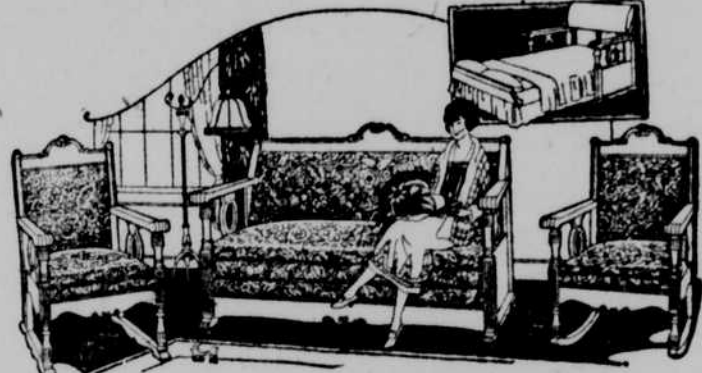
Bed Davenport Suites

Bedroom Chairs and Rockers About Half Off $13.50 Mahogany Windsor Chairs for $9.50 $27.50 Mahogany Windsor Chairs for $15.00 $32.50 Mahogany Windsor Chairs for $17.50 $27.50 Mahogany Cane Chairs, only $16.50 $7.50 Mah. Queen Anne Dress Chair $5.00 $39.50 Mahogany High-Back Chair $29.50 $27.50 Mah. tapestry covered Rocker $19.50 $21.50 Mah. tapestry covered Rocker $14.95