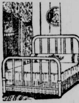
Odd Steel Beds

$45.00 Ivory Breakfast Suite, table and four chairs..... $32.50 $52.50 Ivory Suite, table and four upholstered chairs..... $34.50 $82.50 5-piece mahogany and gold finished suite..... $54.50 $97.50 5-piece Ivory Breakfast Suite, trimmed in blue..... $67.50