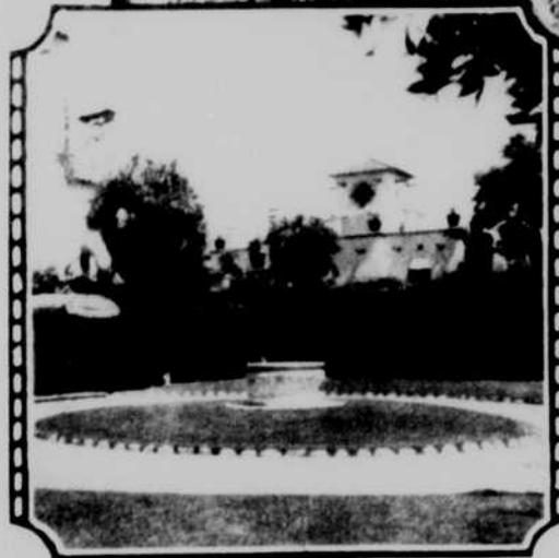
A "hacienda" near San Francisco Bay