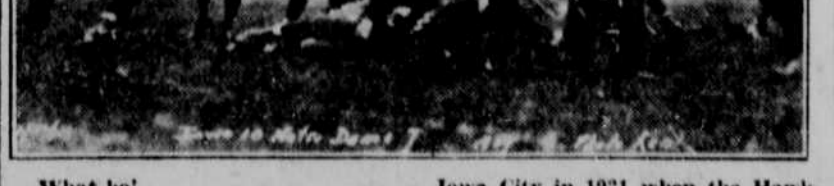
Here's "Chet" Wympe, Creighton's new football coach in action. This photo was snapped during the Iowa-Notre Dame grid game at Iowa City in 1921 when the Hawkies handed the South Bend team its only defeat of the season.