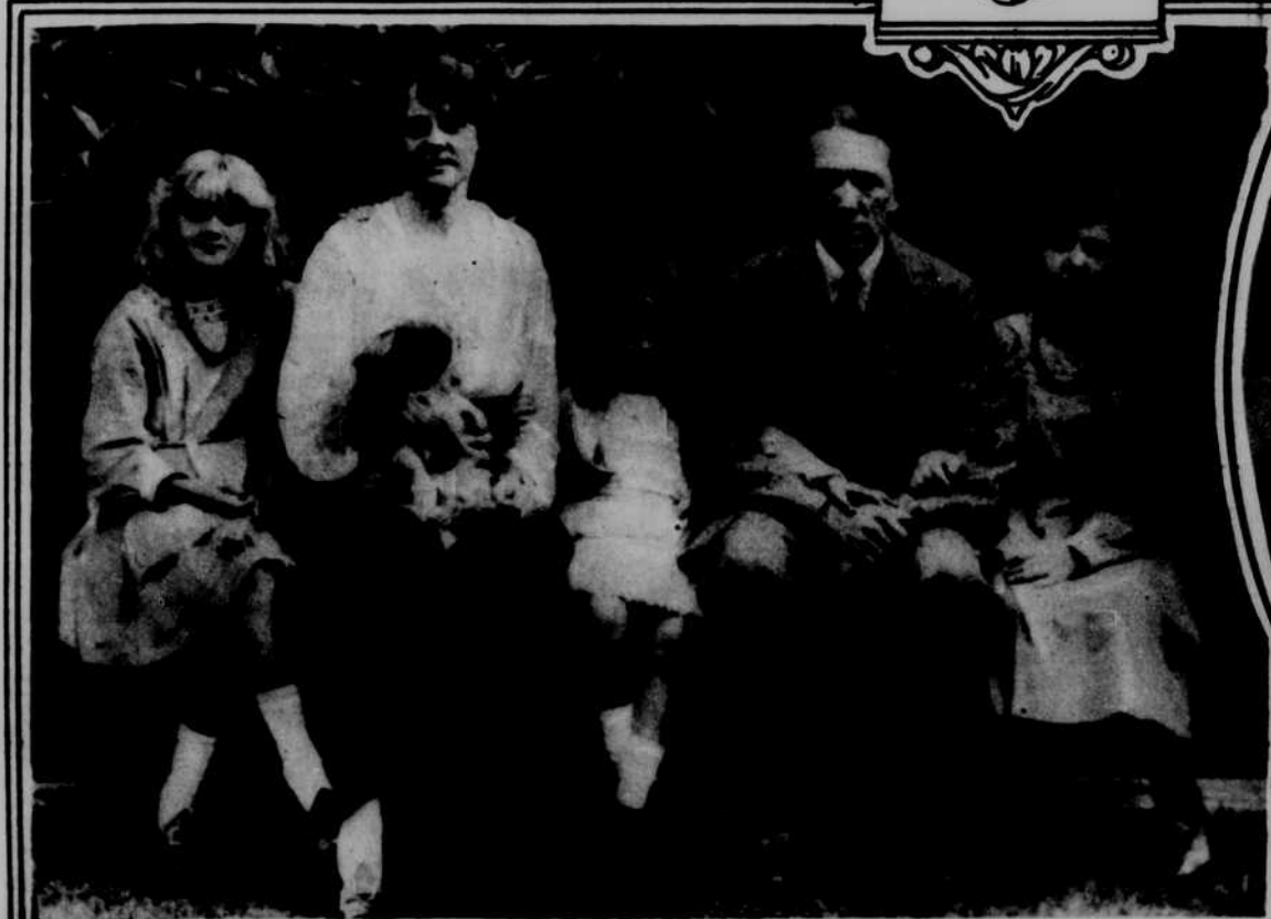
A well known English actor and his family—a new photo of Sir Gerald du Maurier, with Lady du Maurier and their three daughters.