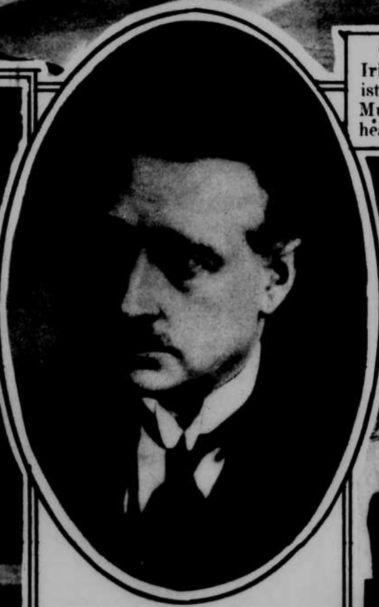
Defender of Ireland's policy to Valerites—William T. Cosgrave, President of the Irish Free State, at his desk in Dublin.