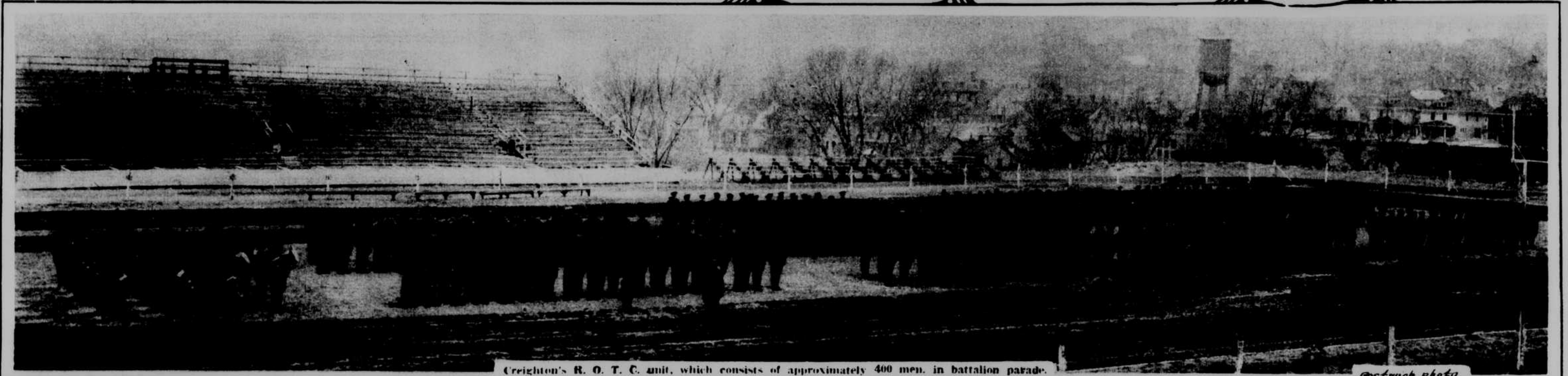
Creighton's R. O. T. C. unit, which consists of approximately 400 men, in battalion parade.