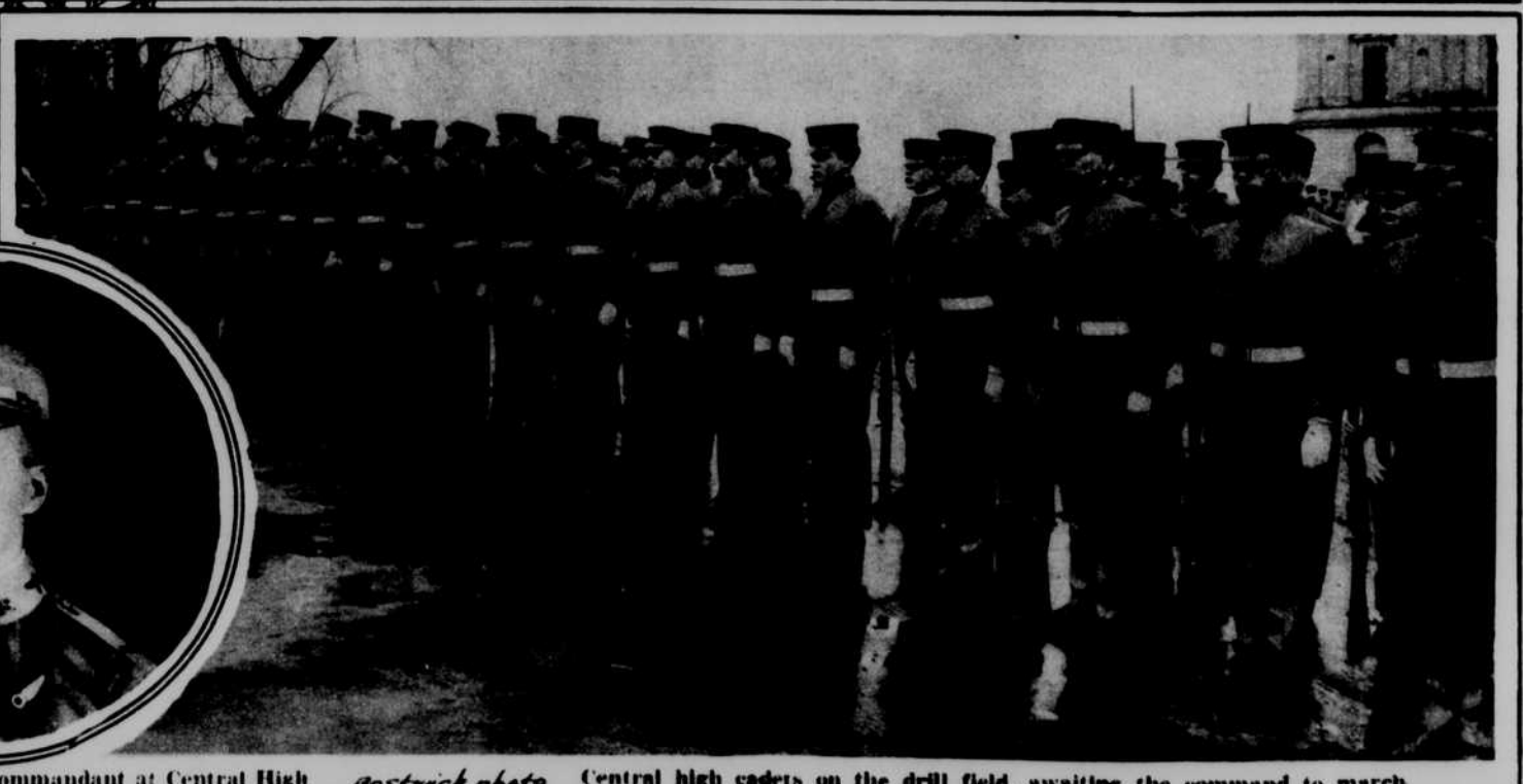
Central high cadets on the drill field, awaiting the command to march