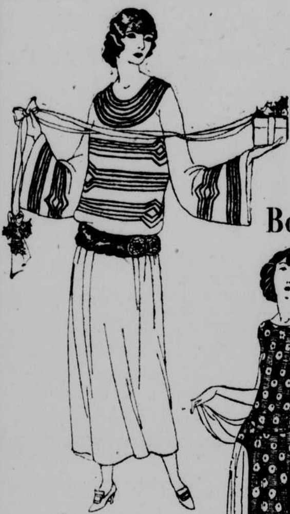
The Evening Gowns of Velvet Are Especially Distinctive