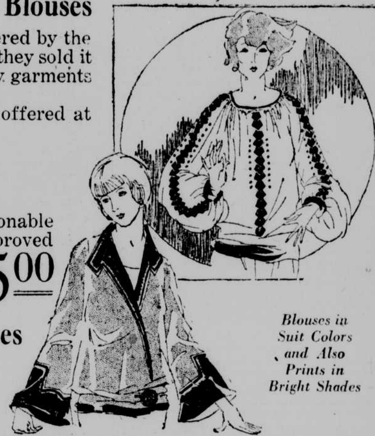
Blouses in Suit Colors and Also Prints in Bright Shades