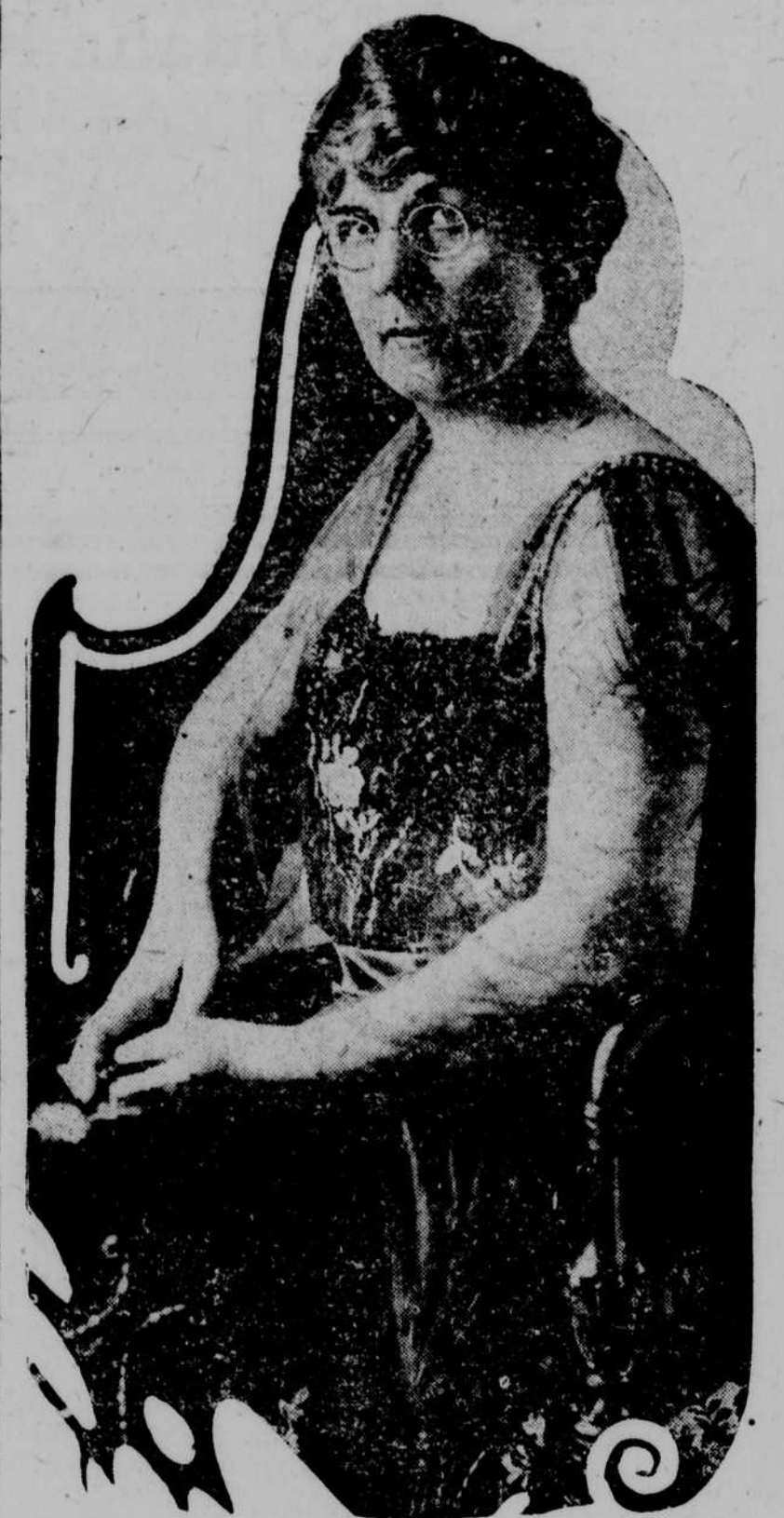
MRS. WARREN G. HARDING.

Her physicians declare that, unless there is a totally unexpected relapse, Mrs. Warren G. Harding, first lady of the land, for whom millions prayed when she was critically ill, will be sufficiently strong to go south with the president on March 6. She has practically abandoned the use of her invalid's chair.