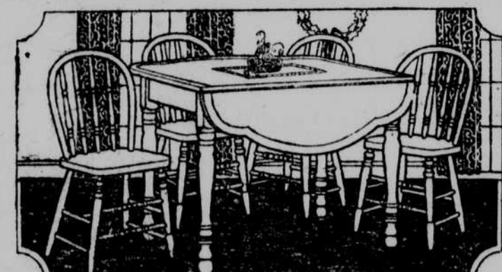
Save Enough for a Congoleum Rug

EVERYTHING FOR YOUR DINING ROOM (COMPLETE) consisting of a solid oak Buffet with long French plate mirror, FOUR Dining Chairs with genuine leather seats, a solid oak Dining Table with extension top, a 42-piece Dinner Set, a 26-piece Set of Wm. A. Rogers' Silverware and a 7'x9' Tapestry Rug—complete outfit $98.50