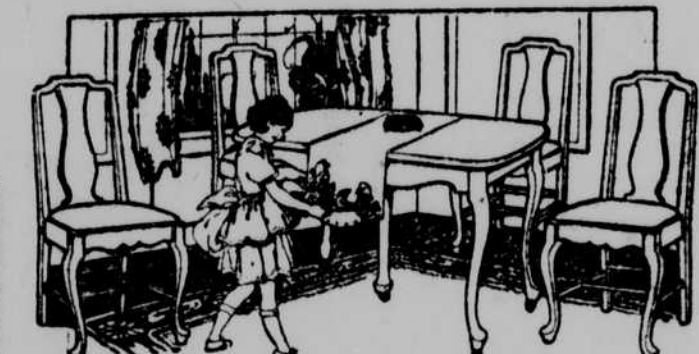
Save Enough to Buy a Dinner Set