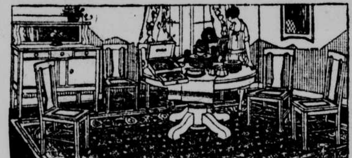
Value-Giving Dining Room Outfit

FOUR-PIECE PERIOD BEDROOM SUITE —A very distinctive period design in genuine walnut veneer with drawer linings of fine mahogany comprising a bow-foot Bed, Chest of Drawers, Dressing Table and Dresser with mirror. $175.00