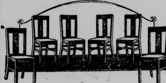
High Grade Chairs at Clearing Prices