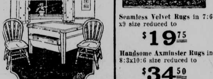
KITCHEN OUTFIT comprising a Kitchen Table Base in white enamel finish with large porcelain top and one bin and TWO oak finished Kitchen Chairs, $15.95 complete for.....