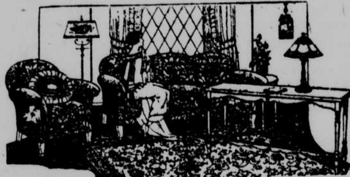
Complete Living Room Set, $157.50

NOTE—We are able at present to show a number of Triple Guarantee Furniture pieces. Watch for further announcements.