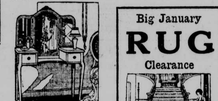
SEMI-VANITY DRESSER —In Queen Anne model in genuine walnut veneer with triple French plate mirrors in the January Clearance is..... $34.50