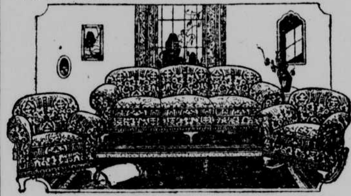
Save Enough to Buy a Floor Lamp