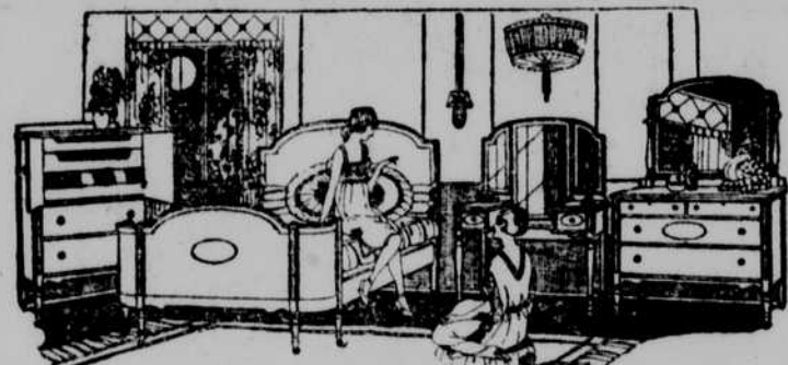
Save $43 on This Clearance Special

Here is a real sensation for our January Clearance Sale. A shipment of wonderful three-piece Over-stuffed Suites with full Marshall spring construction, loose cushions, artistic roll arms, comfortable wing backs and full webbing bottom all upholstered in an exceptionally fine quality of rich blue velour. Reduced for the Clearance Sale to..... $189.50