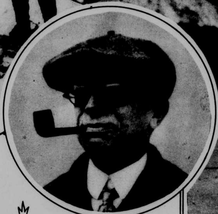
Col. George Harvey, American Ambassador to the Court of St. James, arriving in America on the steamship Berengaria for a conference with President Harding.