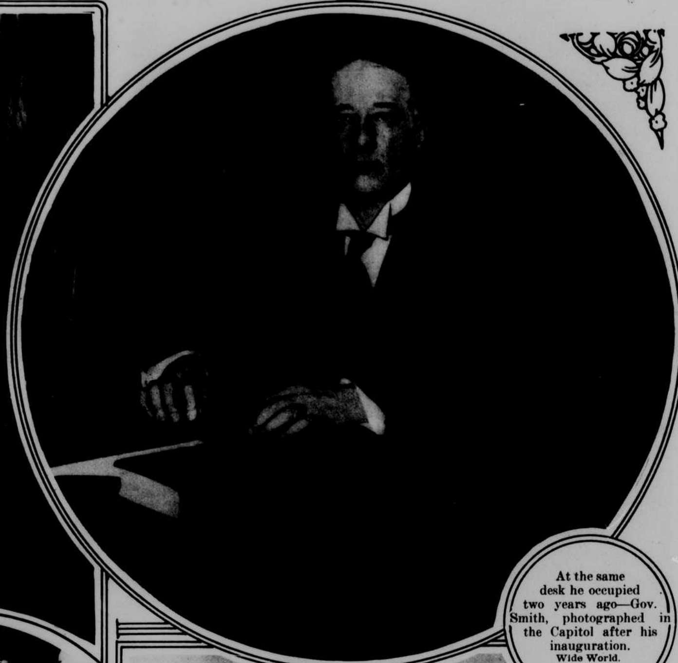
At the same desk he occupied two years ago—Gov. Smith, photographed in the Capitol after his inauguration.