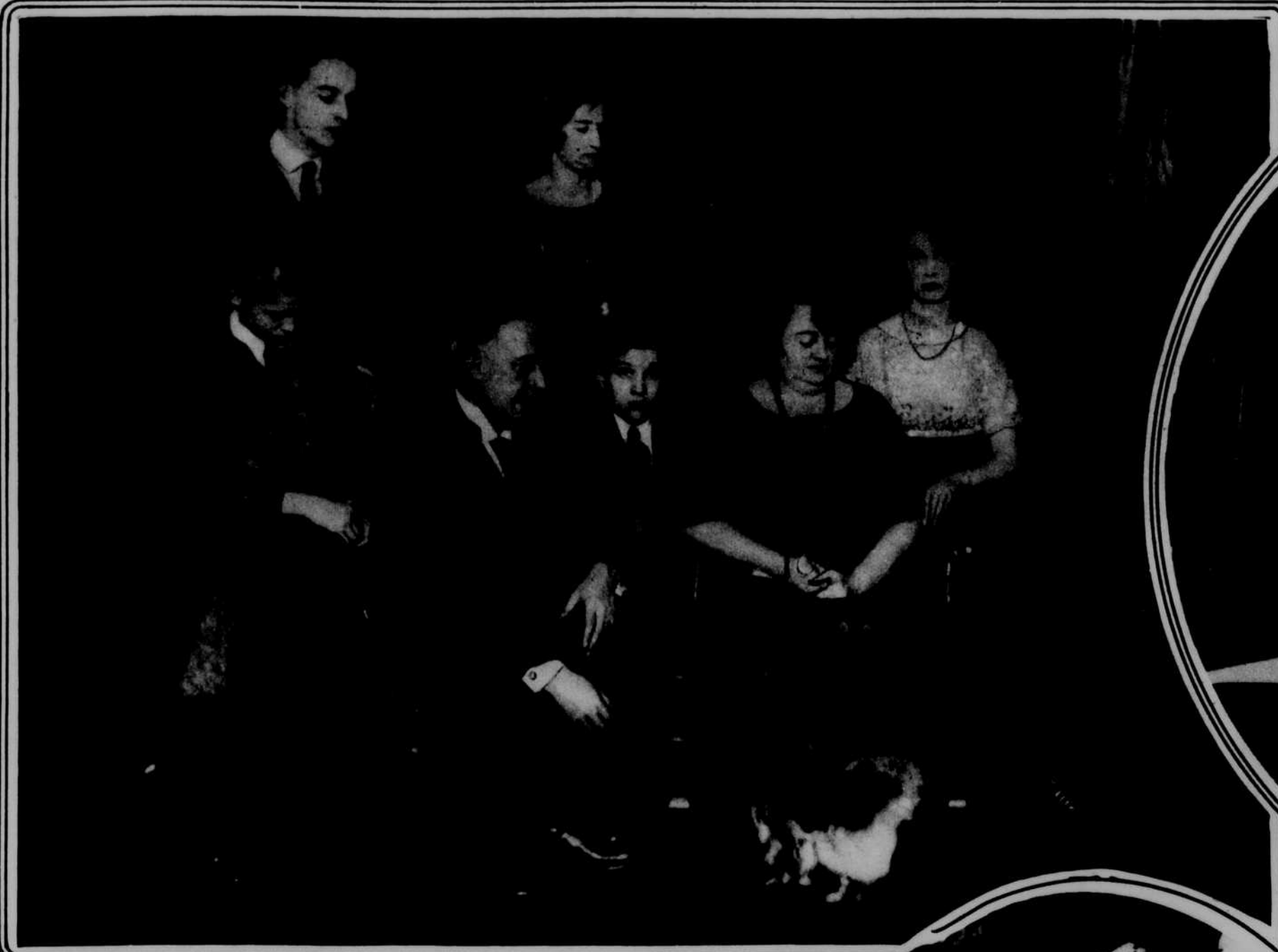
Once more "at home" in the Executive Mansion in Albany—Gov. Alfred E. Smith with his family at the fireside of the official residence in the State capital after being sworn in for his second term.