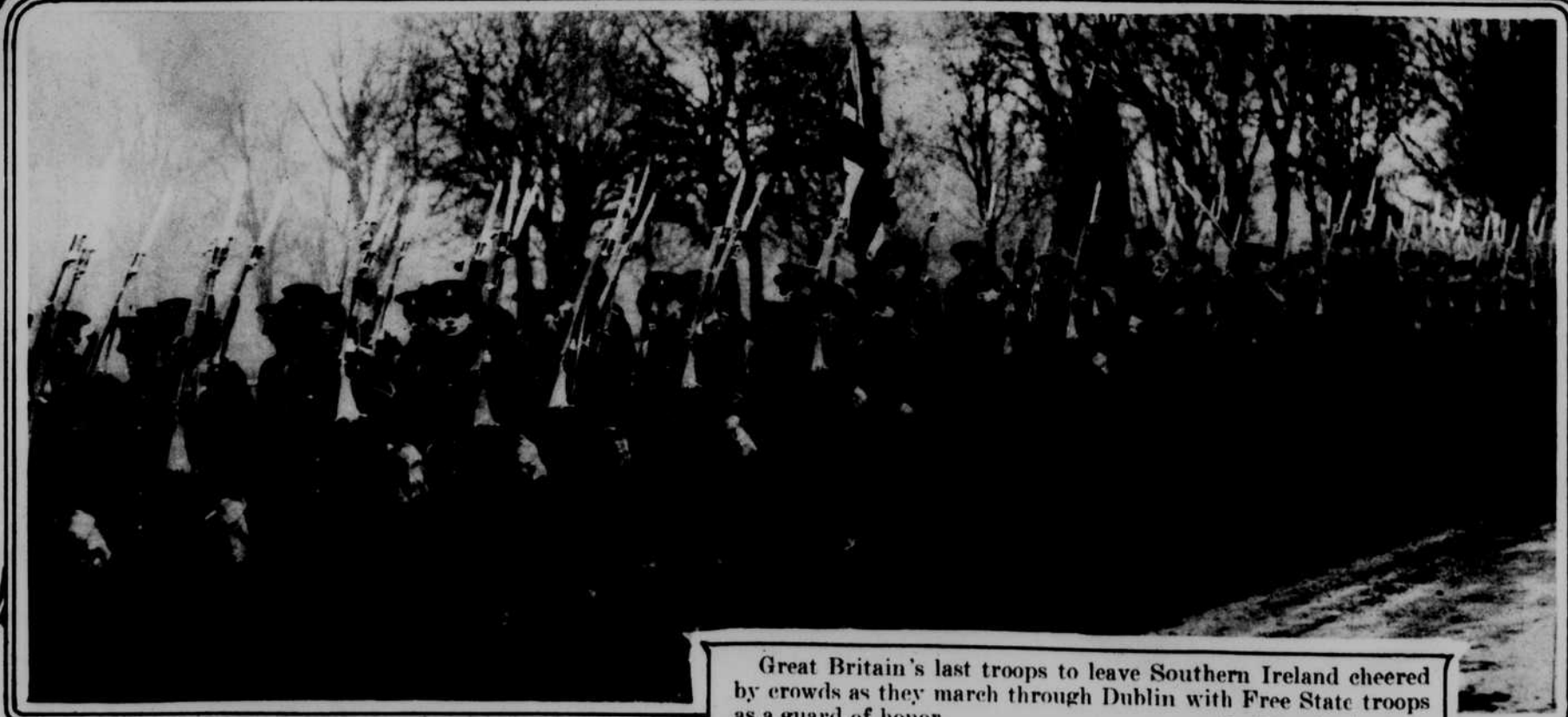
Great Britain's last troops to leave Southern Ireland cheered by crowds as they march through Dublin with Free State troops as a guard of honor. Pacific and Atlantic.