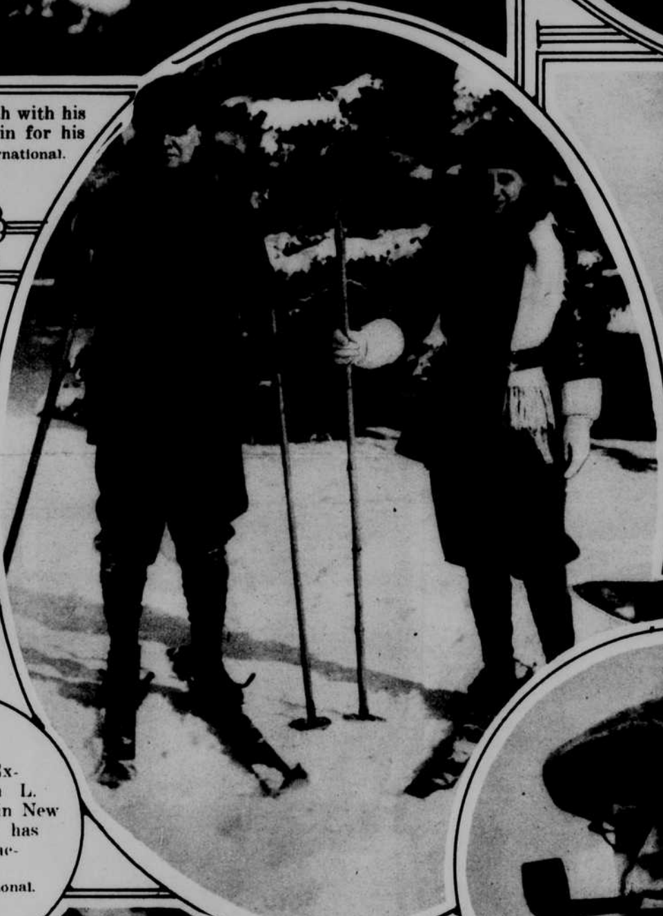
Former Governor and Mrs. Charles S. Whitman in complete enjoyment of winter's outdoor sports on a skiing trip at Lake Placid.