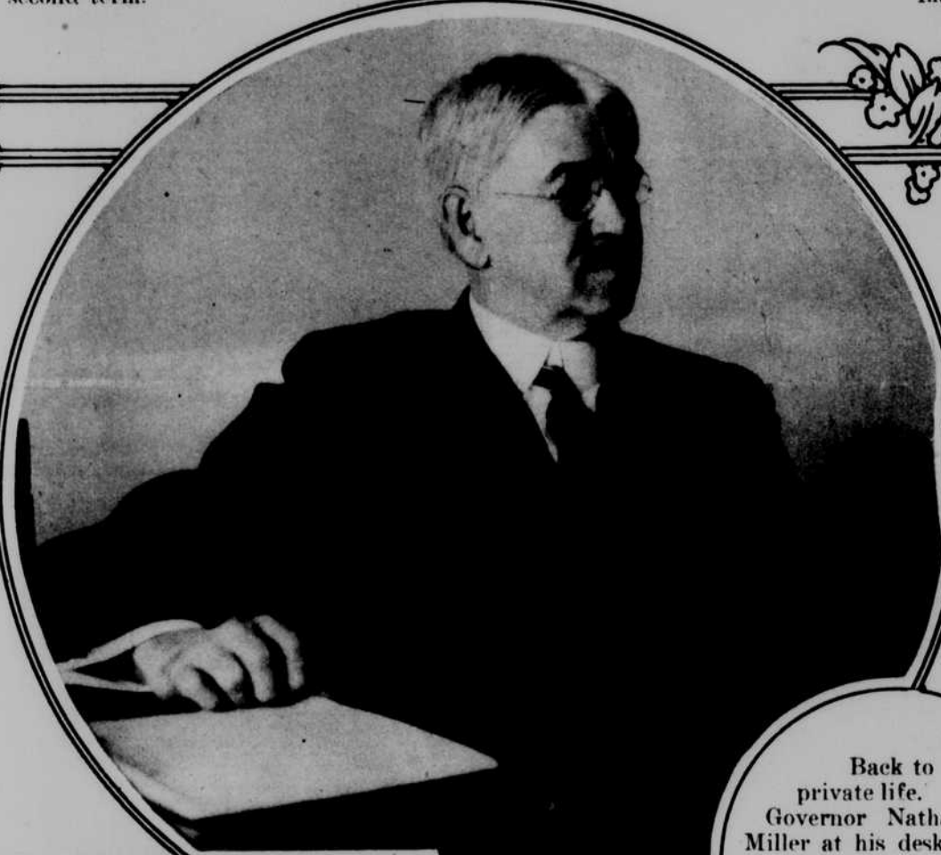
Back to private life. Ex-Governor Nathan L. Miller at his desk in New York, where he has resumed law practice.