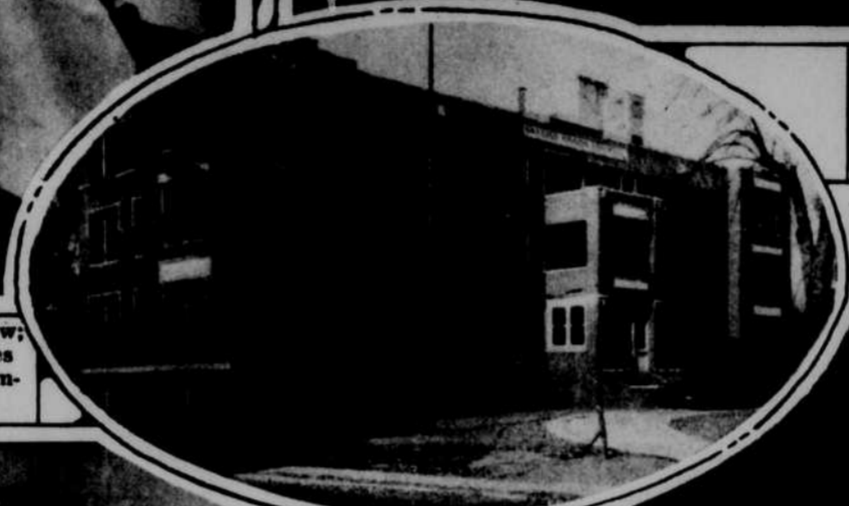
No. 1. Swedish Mission hospital.