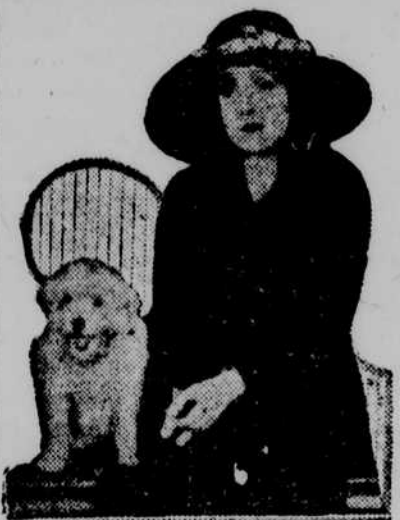
Laurette Taylor, pretty little actress, who made 'Peg O' My Heart' a popular favorite with theatergoers a few years ago, is making a movie now with the same name.