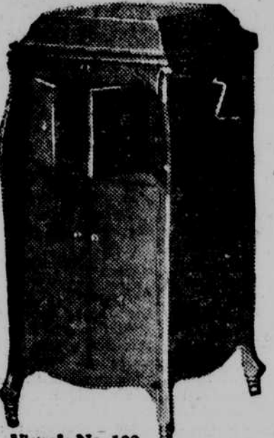
Victrola No. 100 $150 Mahogany, oak or walnut