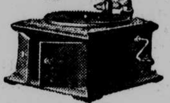
Victrola No. 335 $35 Mahogany or oak