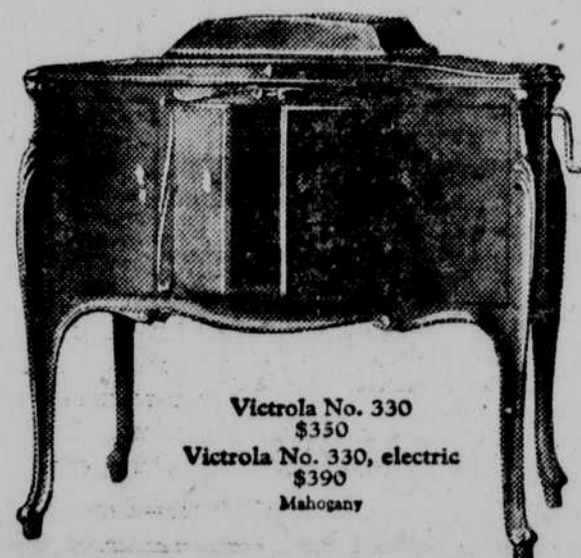
Victrola No. 330 $350 Victrola No. 330, electric $390 Mahogany