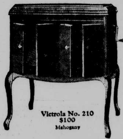
Victrola No. 210 $100 Mahogany