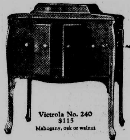
Victrola No. 240 $115 Mahogany, oak or walnut