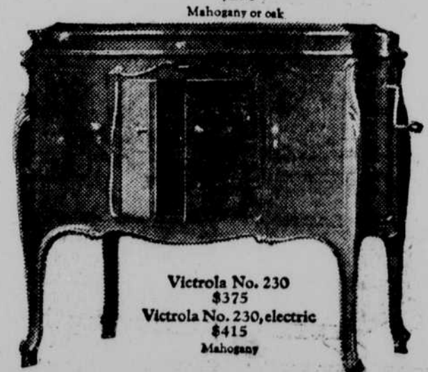
Victrola No. 230 $375 Victrola No. 230, electric $415 Mahogany