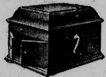
Victrola No. 550 $50 Oak