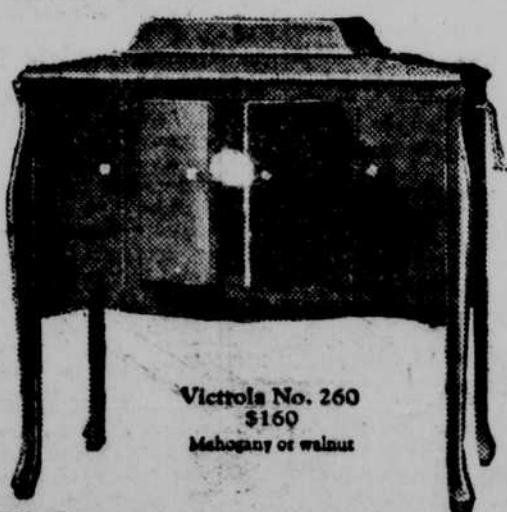
Victrola No. 260 $160 Mahogany or walnut