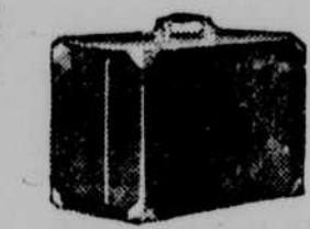
Victrola No. 50 $50 Mahogany or oak

Victrola REG. U.S. PAT. OFF. Important: Look for these trade-marks. Under the lid. On the label. Victor Talking Machine Company Camden, New Jersey