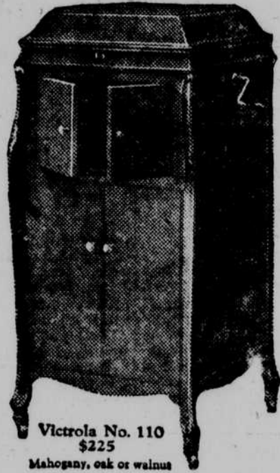
Victrola No. 110 $225 Mahogany, oak or walnut