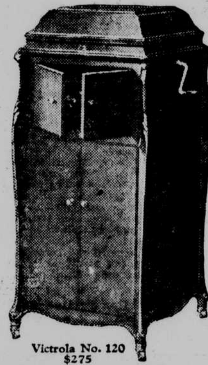
Victrola No. 120 $275 Victrola No. 120, electric, $315 Mahogany or oak