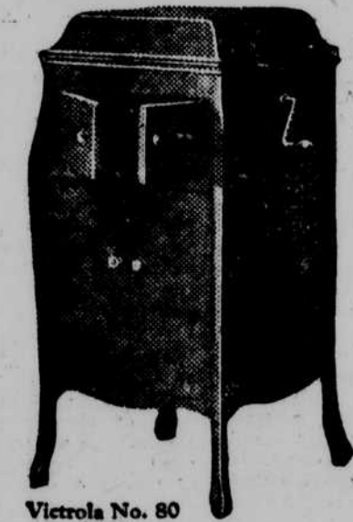
Victrola No. 80 $100 Mahogany, oak or walnut