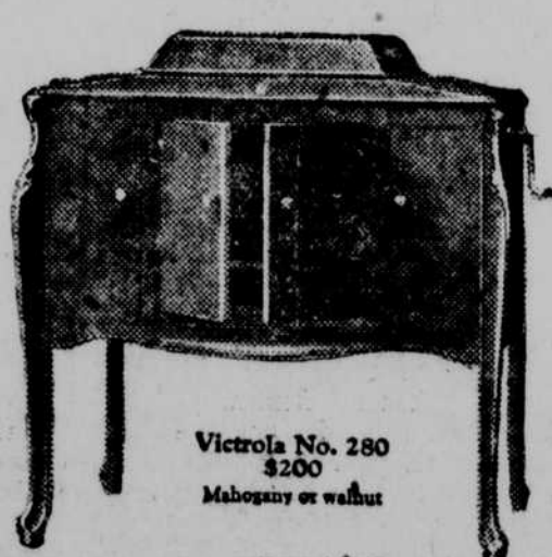
Victrola No. 280 $200 Mahogany or walnut