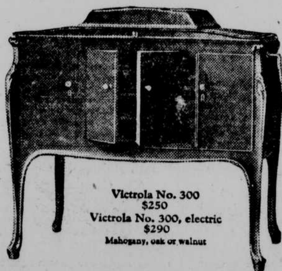
Victrola No. 300 $250 Victrola No. 300, electric $290 Mahogany, oak or walnut