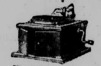
Victrola No. 225 $25 Oak