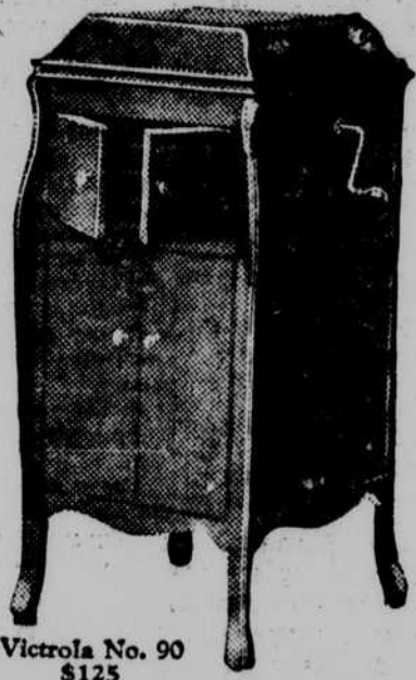
Victrola No. 90 $125 Mahogany, oak or walnut