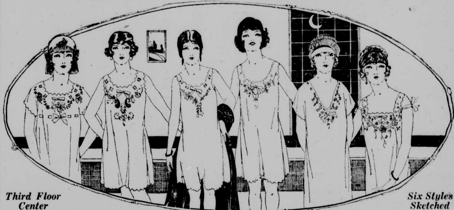
Third Floor Center