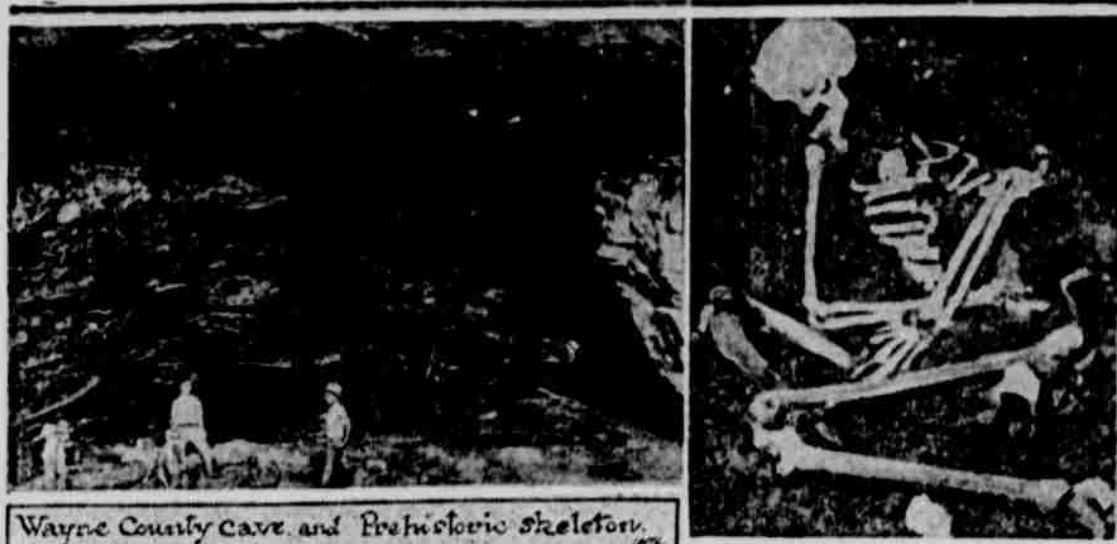
Wayne County Cave and Prehistoric Skeletons.

Proof that America was inhabited thousands of years before the discovery by Columbus has been found in the Hines Cave, Wayne county, Kentucky, by scientists of the University of Kentucky. A succession of ash banks at various levels indicate that the cave was occupied by Indians in differing stages of civilization. Near the ash banks were found axes, pipes, needles and skinning knives. Eight or nine skeletons were found, all being buried with the knees doubled up and heads turned to one side, as was the Indian custom. Folded in the arms of one woman was the skeleton of her baby. The skeleton here shown had an arrow head in it, probably the cause of death.