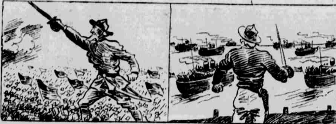
After sending millions of American troops to France to save the allies from defeat—