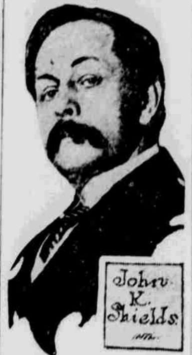
United States Senator John R. Shields, Democrat, of Tennessee, has been mentioned by President Harding, as associate justice of the United States supreme court, to succeed Justice William R. Day, who resigned. He will be the first southerner to be named by President Harding.