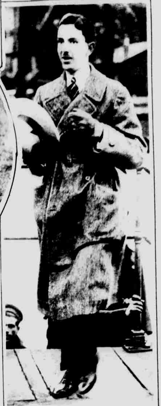
Crown Prince Umberto of Italy, heir to the throne, stepping ashore at Gravesend on his visit to England. International