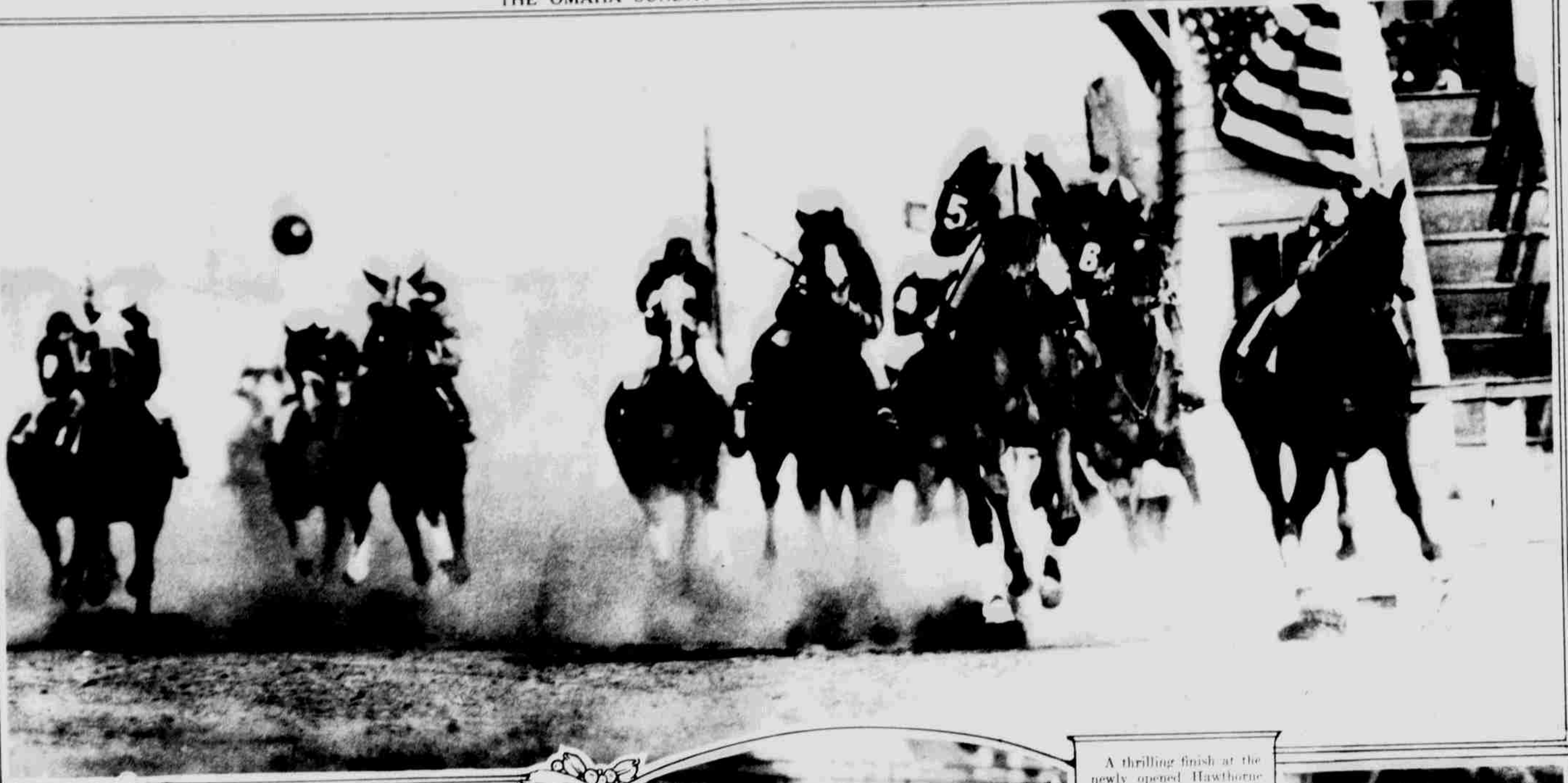
A thrilling finish at the newly opened Hawthorne racetrack in Chicago with End Man, the winner, on the rail on the extreme right of the photograph.