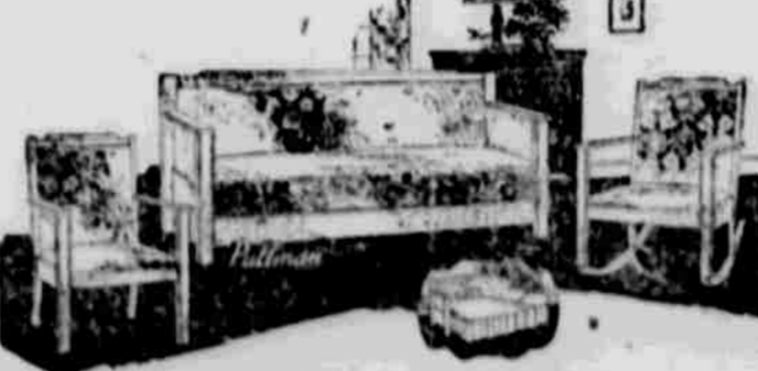
Pullman Bed Davenport Suite of three handsome pieces with birch mahogany finished frames comfortably upholstered in arch looking, blue velour. Davenport opens up into full size bed for two people—Saturday, this suite is $98.50

The Most Delicious Chocolates in POUND Boxes 39c Here is the "candy buy" of Omaha—delicious whipped cream, caramel and nougat centers covered with a thick coating of delicious Bitter Sweet and Milk Chocolate—the pound box at 39c.