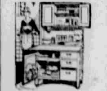
Kitchen Cabinet of solid golden oak with porcelain working top, large bin and compartments for $34.50

Homes Furnished Complete Our Fall stocks are at the very peak of completeness. To select a Home Outfit now is to choose from the very cream of what the markets afford. 3 Rooms, $194.50 4 Rooms, $267.50 5 Rooms, $322.50