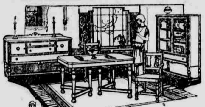
Eight-Piece Dining Room Suite, in rich walnut finish, comprising a long, 60-inch buffet, an oblong table that extends to 6 feet, FIVE chairs and an armchair upholstered in blue leather—the suite, without china closet, is $119.50