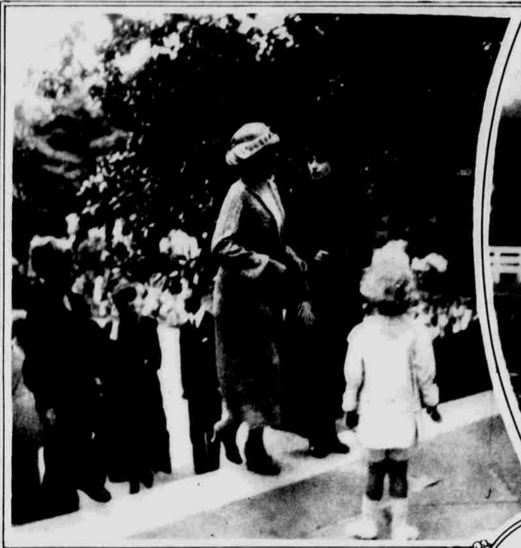
Queen Victoria of Spain snapped with the former Empress Zita of Austria and her children while on a visit to the palace of the Marquis of Torregrassa, where Carl's widow makes her home.