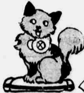
Mischief is always teasing Chang! (Don't know that I blame her.)