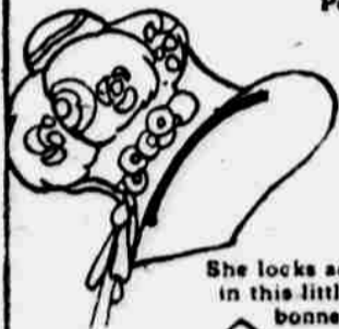
She looks adorable in this little poke bonnet