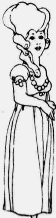
This is the dress she wears in the Sedan chair. The others are too—well, they wouldn't fit very well, would they?