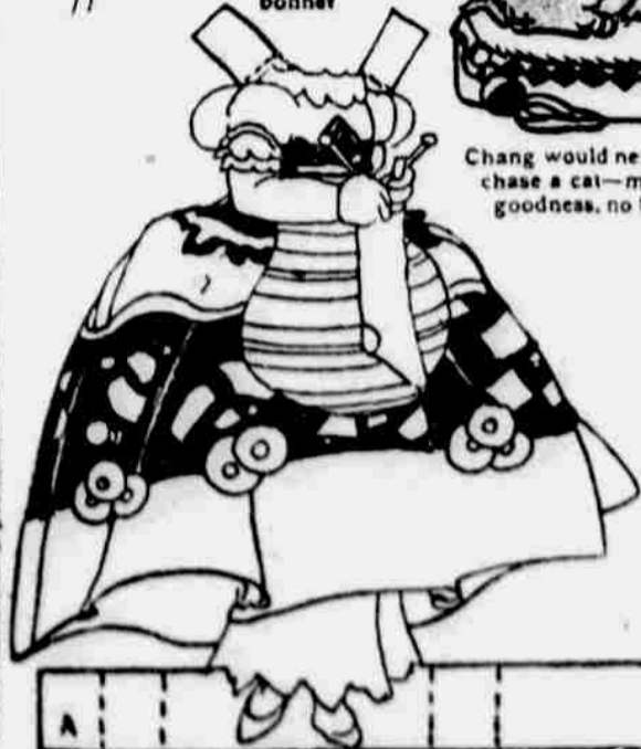
I wonder who she is knitting that sock for?