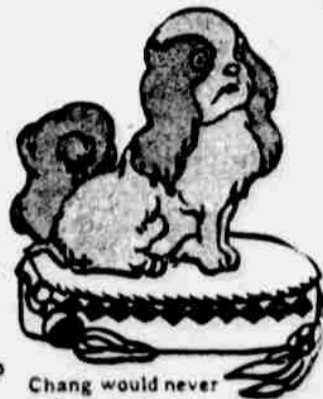
Chang would never chase a cat—my goodness, no!