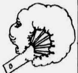
She carries this lovely fan to all her parties.