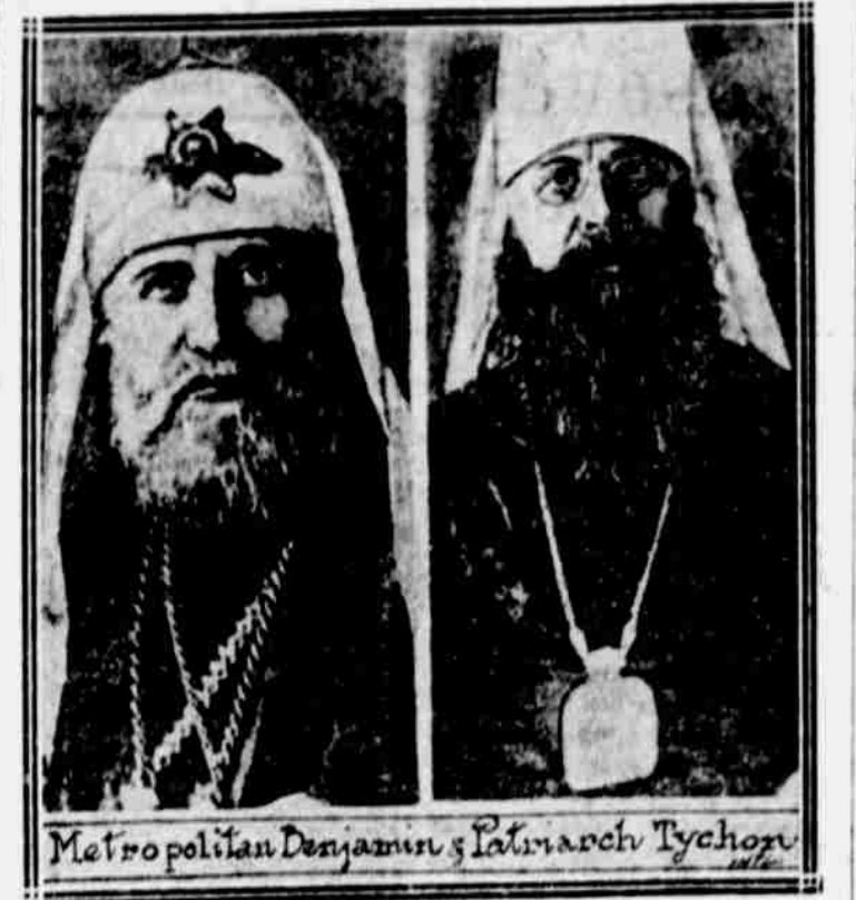
Metropolitan Demetrius of Tchernov

The metropolitan bishop and the Russian pontiff, Patriarch Tychon, of the old Greek orthodox church, which formerly was recognized as supreme in Russia, are under sentence of death for urging resistance to the soviet forces and attempting to prevent the confiscation of church property.