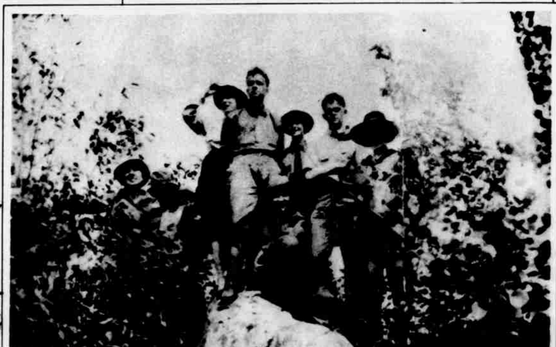
Lost Lake, S. D., is no longer "lost" to the Walking club "exploration party." It was from the rock shown above they sighted the lake after a long and arduous hike.