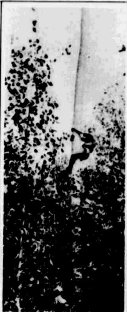
When the "gang" lost their bearings in thick underbrush, Leslie Williams climbed a tree to look for the best way out.