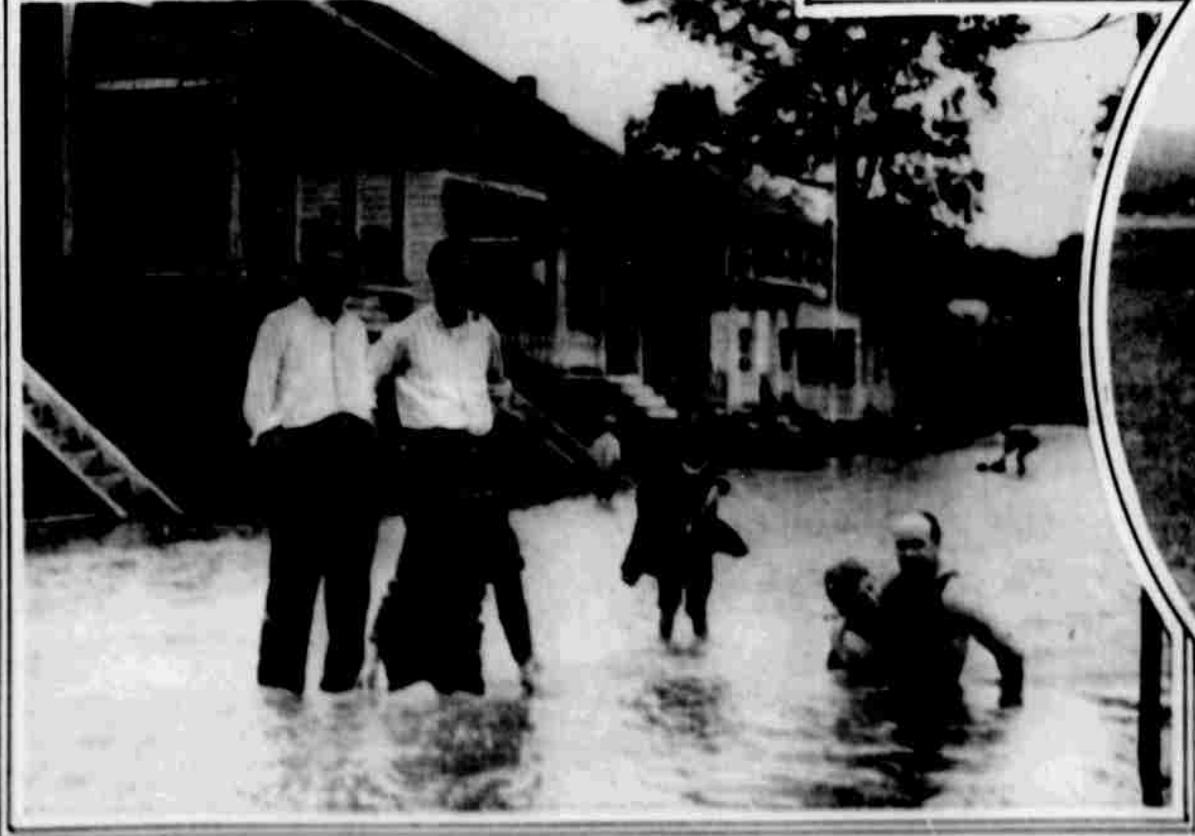
Heavy rains in Washington and its vicinity marked the early part of last month. In North Rosemont, Va., the residents made use of the flooded streets as a swimming pool.