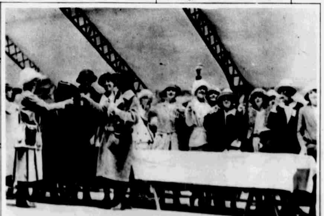
Delegates sampling the products of the famous Pommery champagne cellars at Reims.