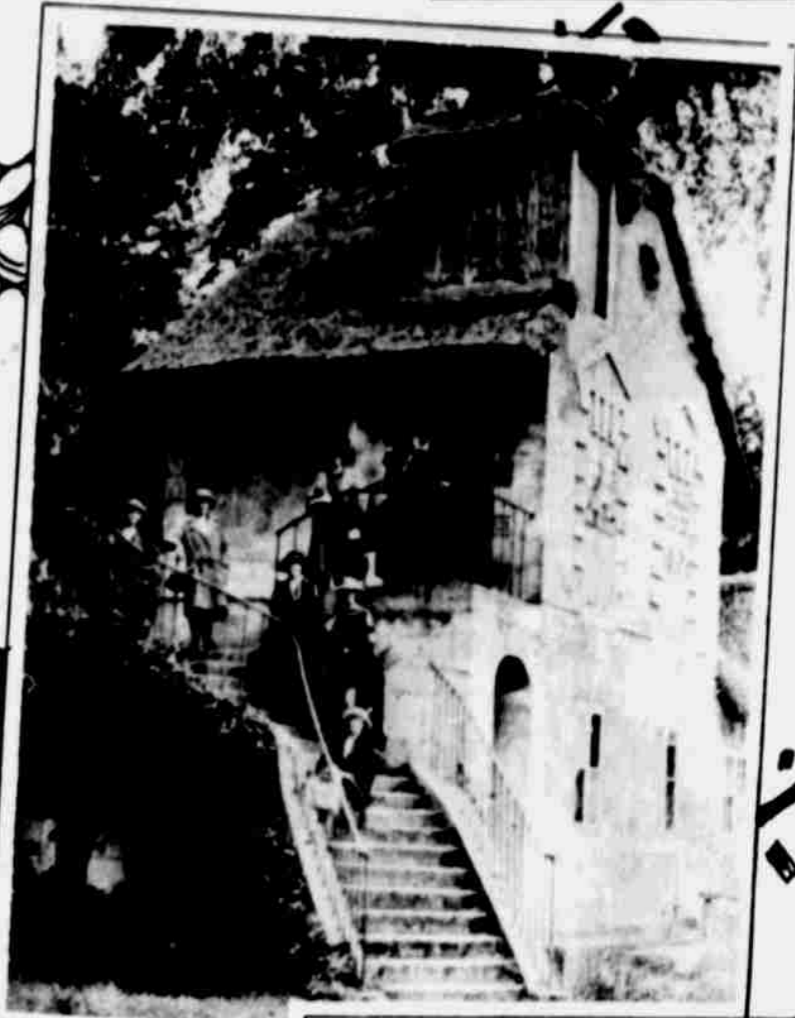
Omaha members of the Good Will delegation photographed in the Swiss village of Marie Antoinette at Versailles.