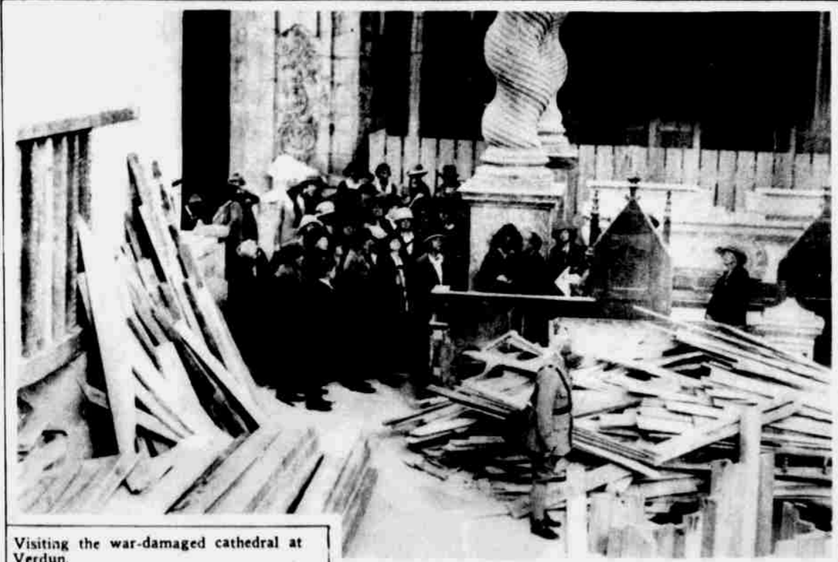
Visiting the war-damaged cathedral at Verdun.