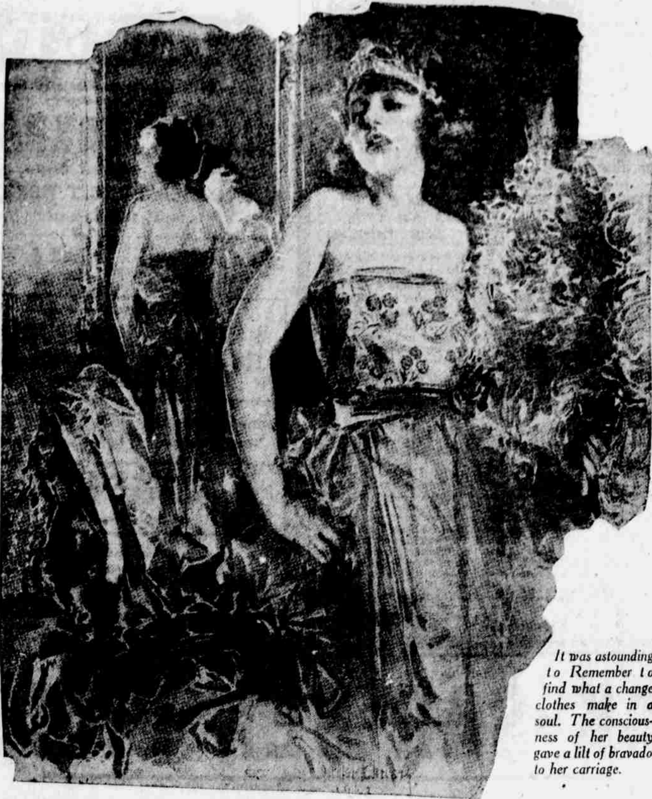
It was astounding to Remember to find what a change clothes make in a soul. The consciousness of her beauty gave a lilt of bravado to her carriage.

Not merely as a startling revelation of real life in California's inner circle of Movieland, but as the most searching, the most illuminating study of a girl's soul life; such is the thrill and absorbing fascination of Rupert Hughes' newest and greatest novel.